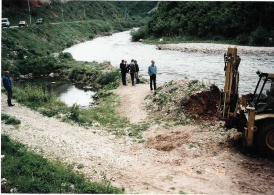
Photo 1. Dariva 1 Site.