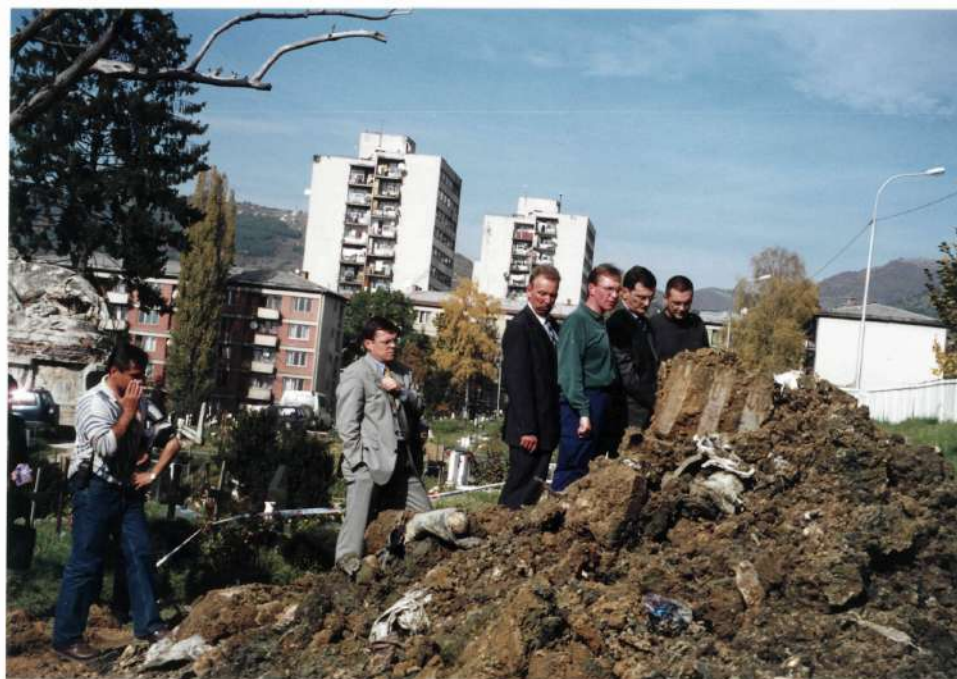
Photo 1. Vrbanjci Site.