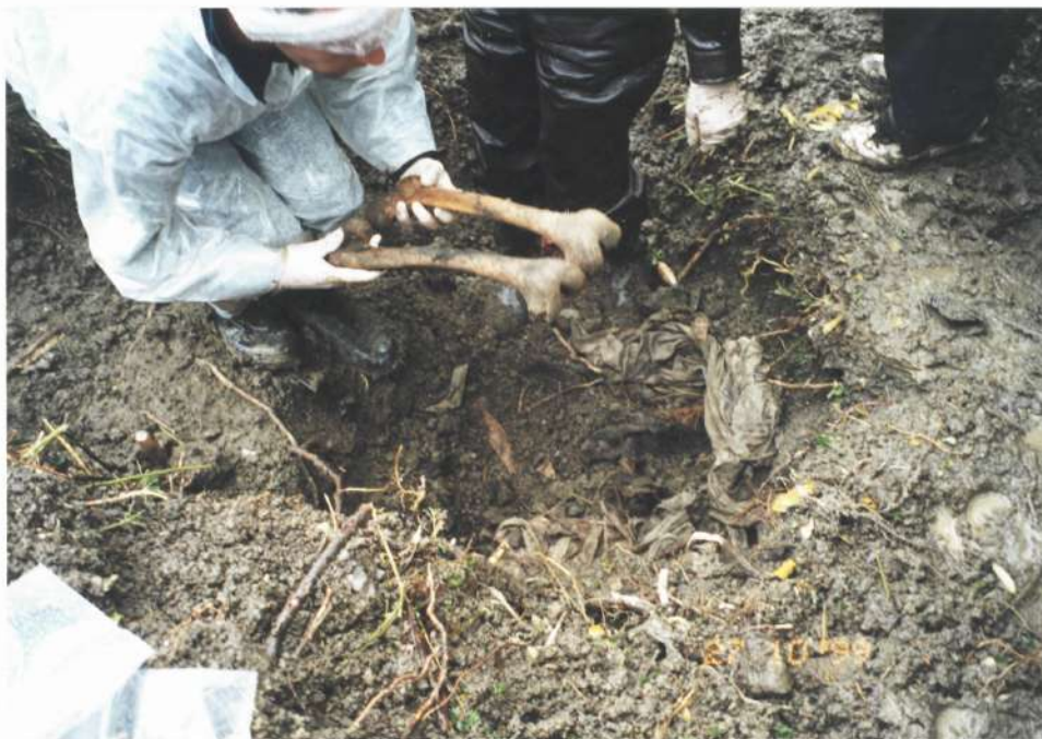
Photo 3. Exhumation in progress at Hrvacani Site.