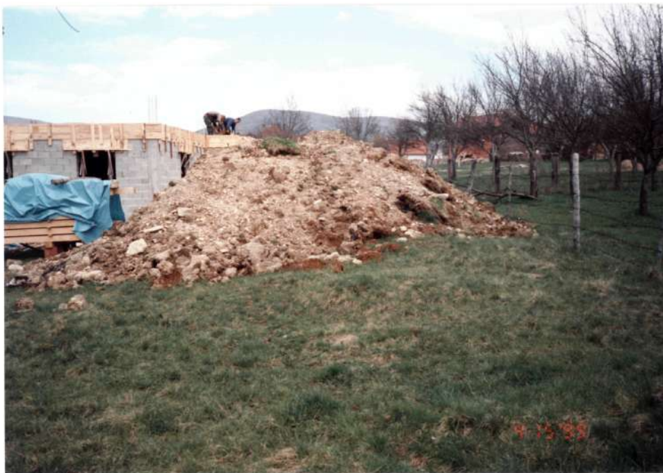
Photo 1: View of alleged mass gravesite next to Motel Ero-9 (Photo roll 99-5, exp. 3)