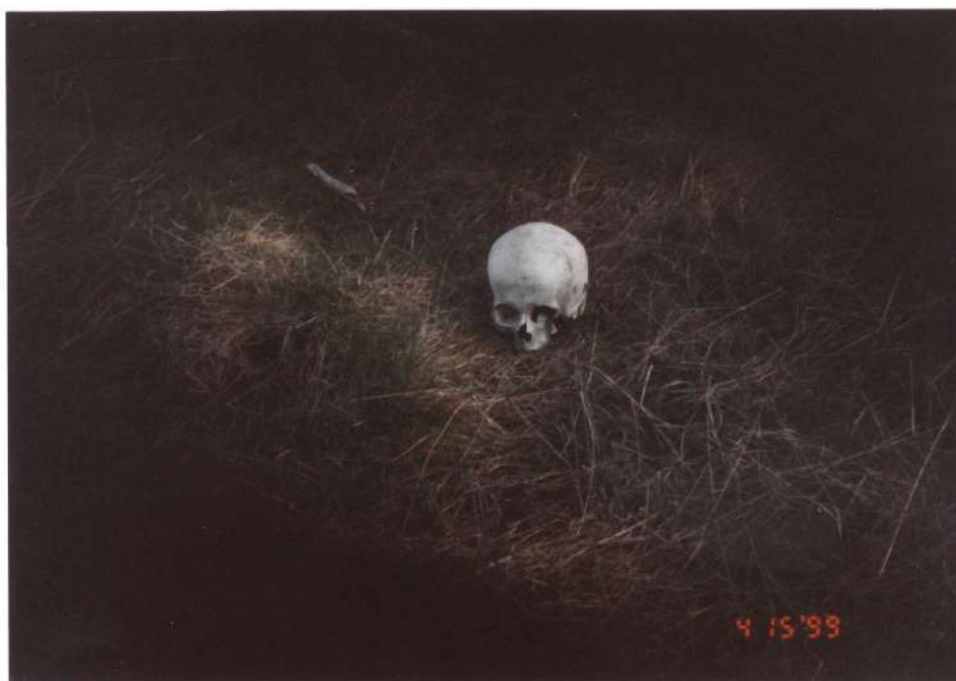
Photo 2: Cranium in field near Vodenica (Photo Roll 99-5, exp. 17).