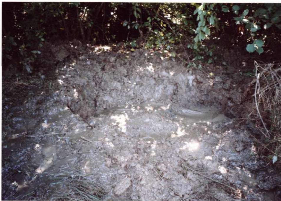
Photo 2. View of human remains in plastic bag at streamside in Žavidovići area.