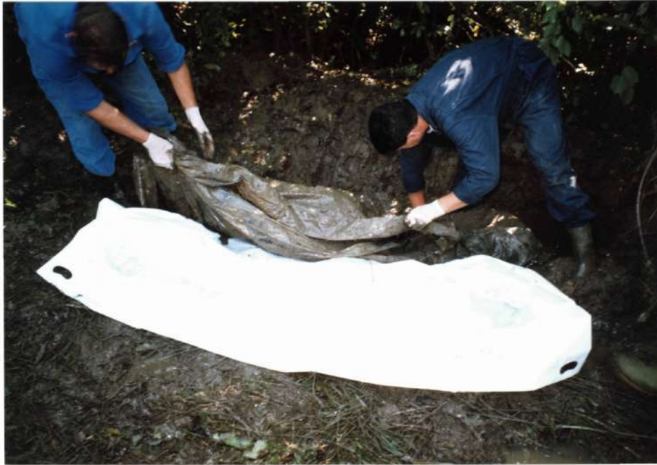
Photo 3. View of laborers placing human remains in labeled body bag.