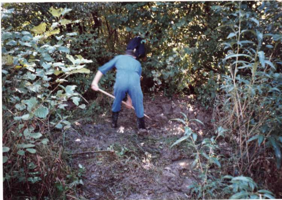
Photo 1. View of laborer beginning to remove muddy soil from riparian grave at Žavidovići.