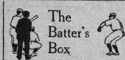
The Batter's Box