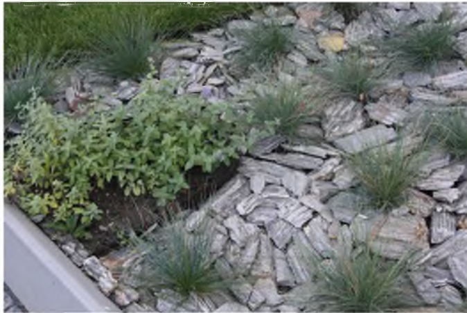
Figure 3: GPP Business Park, Katowice. Gravel accentuated planes with dry grasslands plants. Illustrations: author – K.M.Rostanski