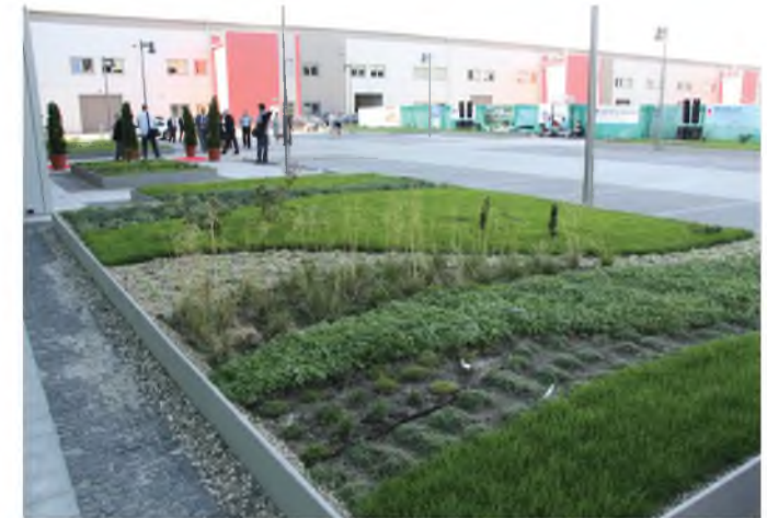
Figure 1: GPP Business Park, Katowice. Flowerbed with native plants and lawn. Illustrations: author – K.M.Rostanski