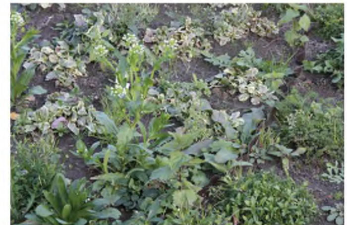
Figure 2: GPP Business Park, Katowice. Initial composition with native plants. Illustrations: author – K.M.Rostanski