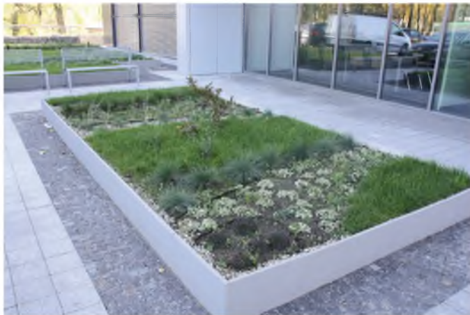
Figure 4: GPP Business Park, Katowice. Composition with native plants and lawn. Illustrations: author – K.M.Rostanski