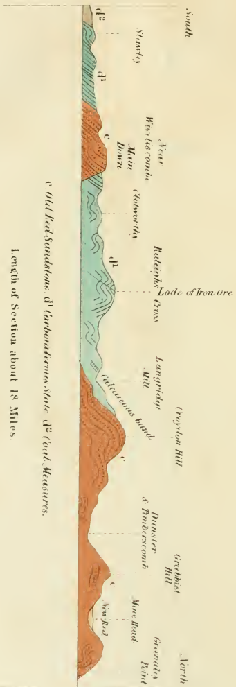
c. Old Red Sandstone. d^1 Carboniferous. d^2 Tertiary Measures.