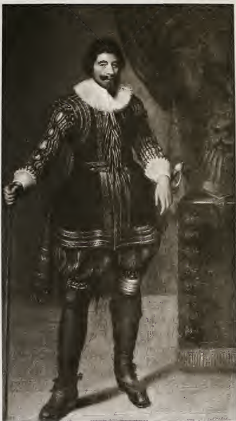
Archibald, 7 th Earl of Argyll