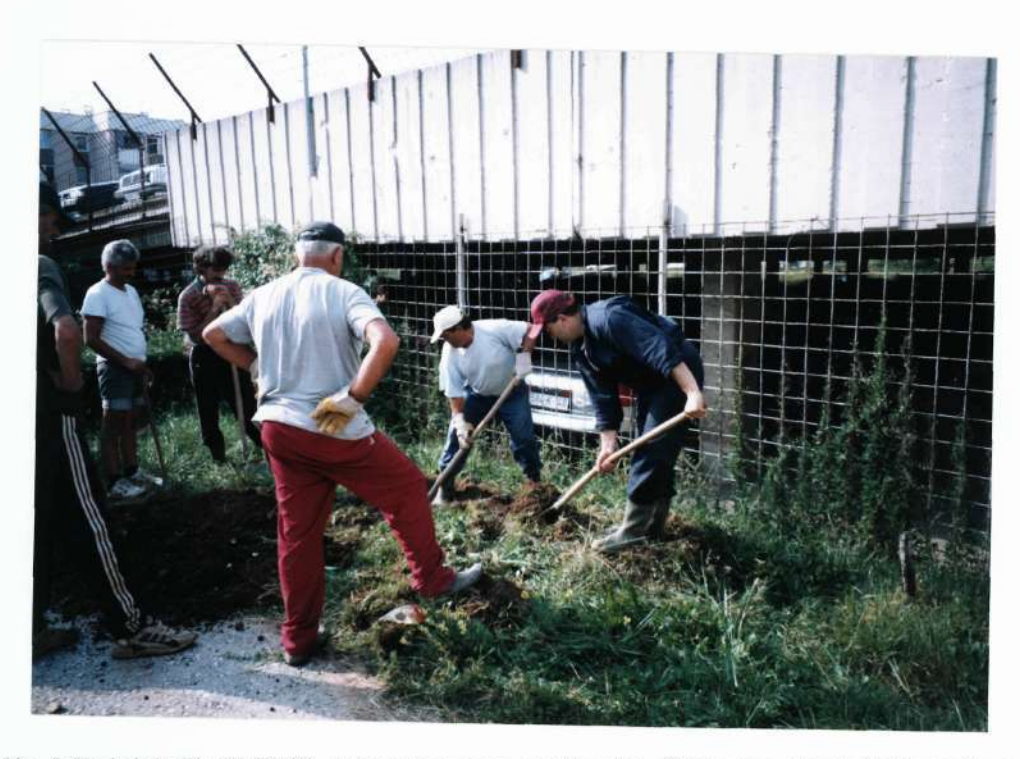
Photo 4. Site 5 (Dobrinja II), 07.07.99. Laborers remove overburden of the grave, located adjacent to a car park in an apartment complex (roll 1007, exp. 14A).