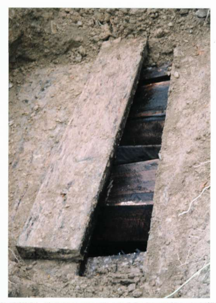
Photo 5. Site 6 (Kunosići), 08.07.99. First grave exposed, containing two well-made coffins in a wooden crypt. The remains did not represent the individuals the Commission sought to retrieve, and the OHR representative did not allow the removal of these remains (roll 1007, exp. 25A).