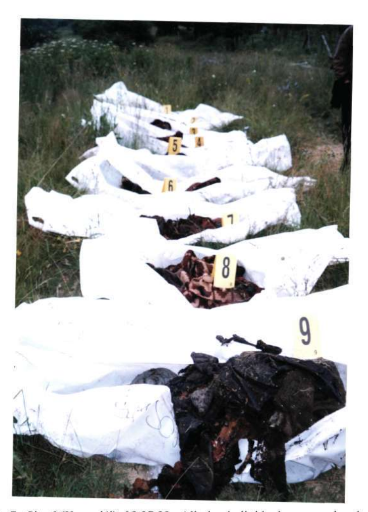
Photo 7. Site 6 (Kunosići), 08.07.99. All nine individuals removed and placed in body bags (roll 1256, exp. 12).