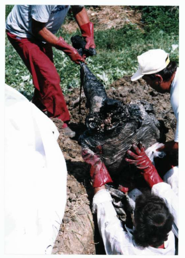
Photo 1. Site 3 (Hotonj), 07.07.99. Laborers remove the remains of HOT 1 from the grave. Remains were saponified (roll 1007, exp. 6A).