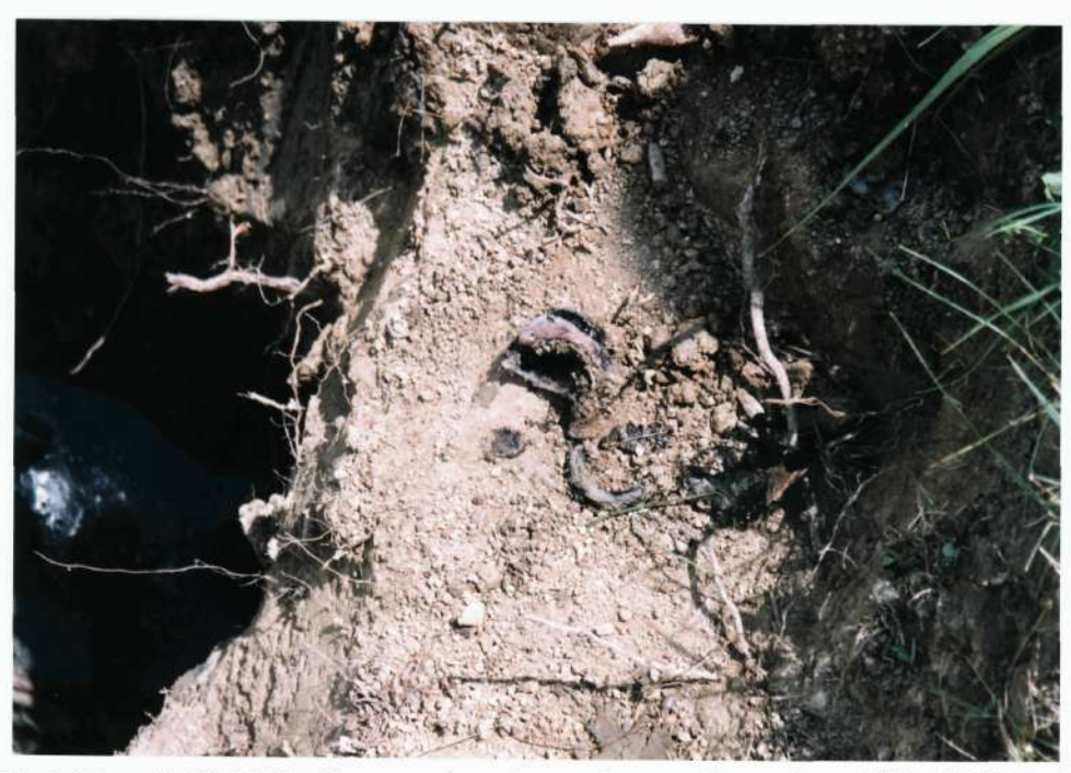
Photo 2. Site 3 (Hotonj), 07.07.99. Close-up view of upper denture plate and mandible of HOT 1. Laborers had stepped on these remains during the removal of the body from the grave and failed to retrieve them until they were pointed out by the PHR Consultant (roll 1007, exp. 7A).