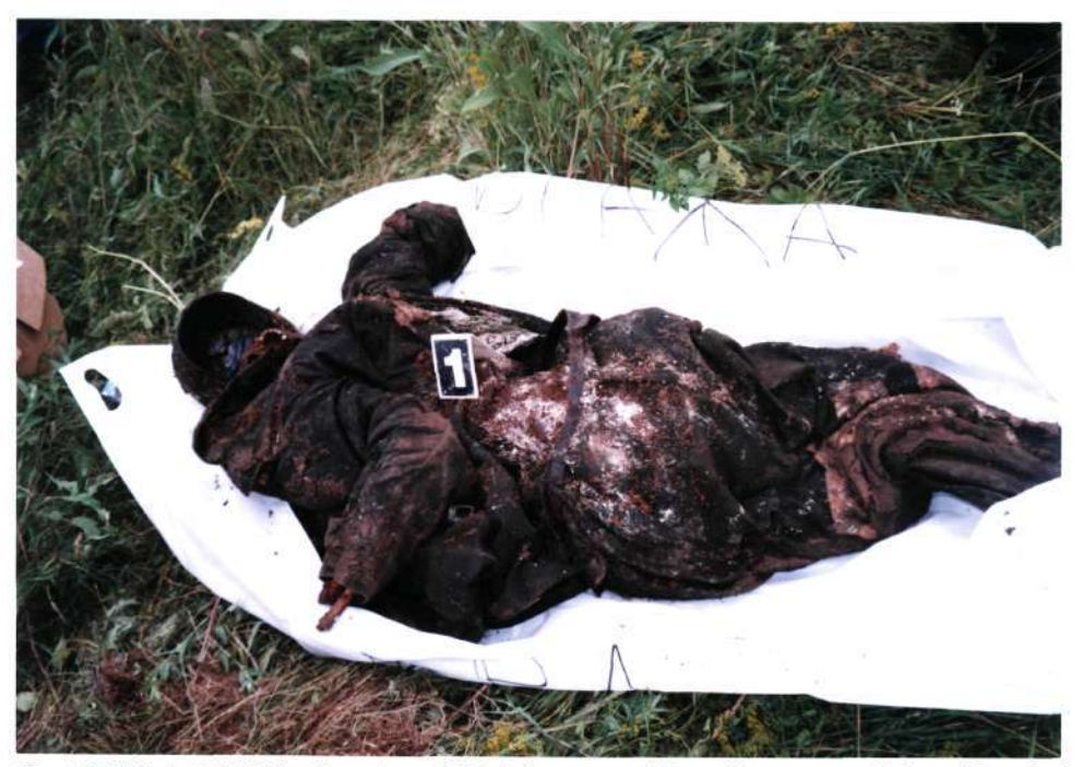
Photo 8. Site 7 (Blaža), 09.07.99. Remains of BLA 1, removed from the grave and placed in a body bag for transport (roll 1256, exp. 20).