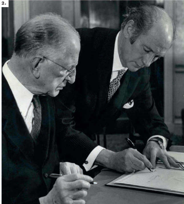
Going to vote.