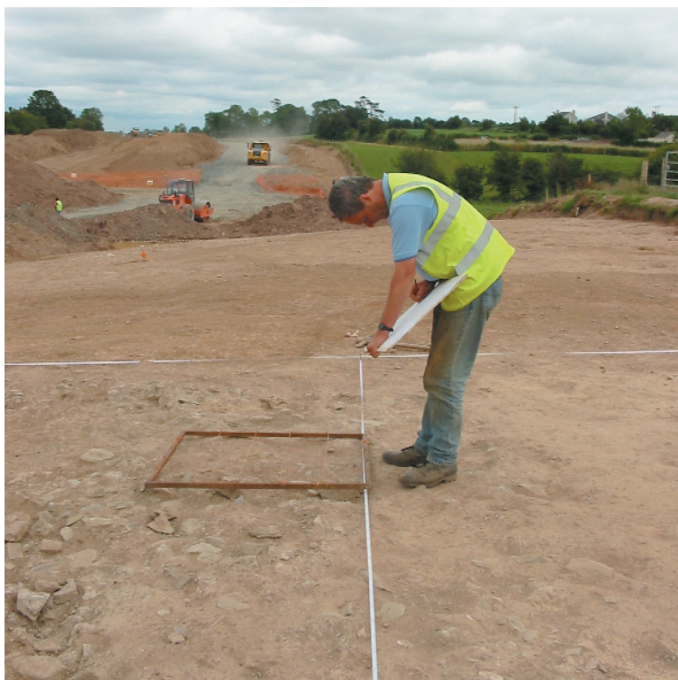
Detailed recording of features on the N22 Ballincollig Bypass (Cork County Council National Roads Design Office)

welcomed, both by archaeologists, as improvements to professional standards, and by engineers, as reductions in archaeological risk during road projects.