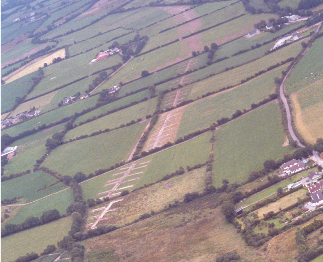
Aerial view of extensive test trenching on the N22 Ballincollig Bypass (Cork County Council National Roads Design Office)