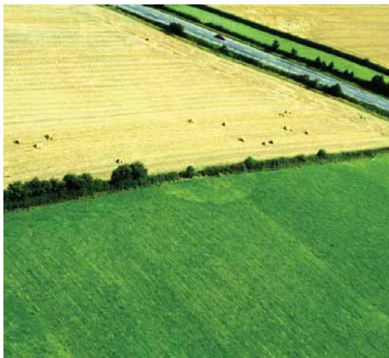
Illus. 7—Cropmark of ringfort (RMP No. LA034-029) in Parknahown townland from the south-west, August 2001