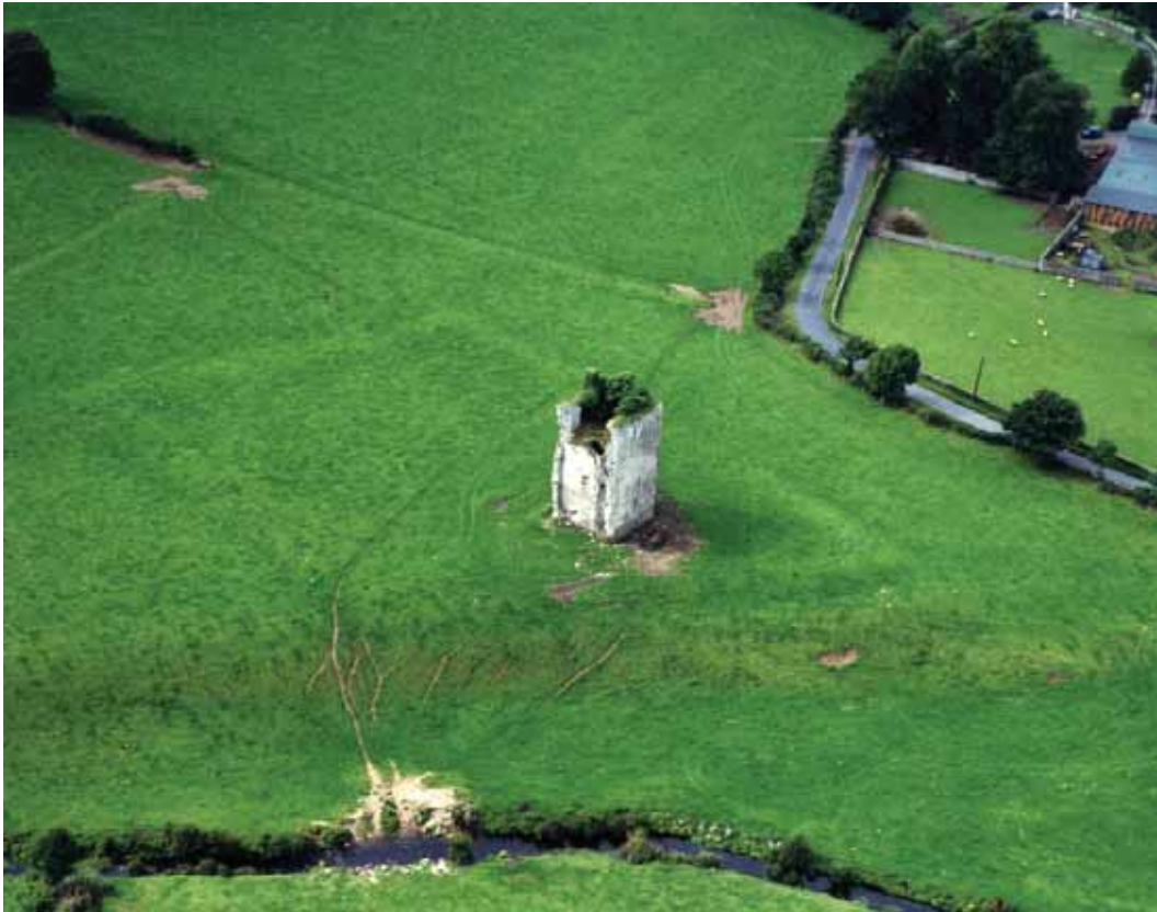
Illus. 3—Gortnaclea Castle (RMP No. LA023-016) with surrounding bawn (enclosing feature) from the east, August 2001

photography. The photographs were taken at an oblique angle to maximise the recognition of subtle features. Given the known level of intensive agricultural practices along the scheme, aerial survey was a particularly important tool for identifying levelled or partly levelled sites that had no visible expression at ground level. It also provided an excellent opportunity to view the proposed road scheme from a different perspective and ensured a familiarity with the landscape.