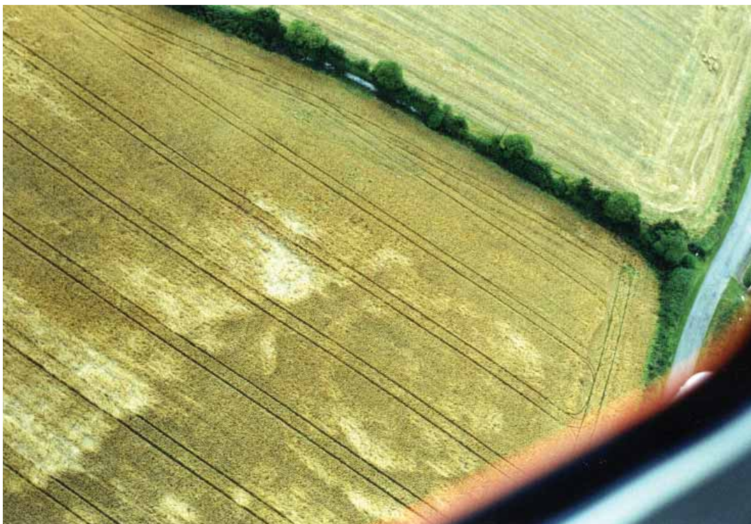
Illus. 8—Newly identified double enclosure in Parknahown townland to the east of an enclosure site (RMP LA034-023), February 2002