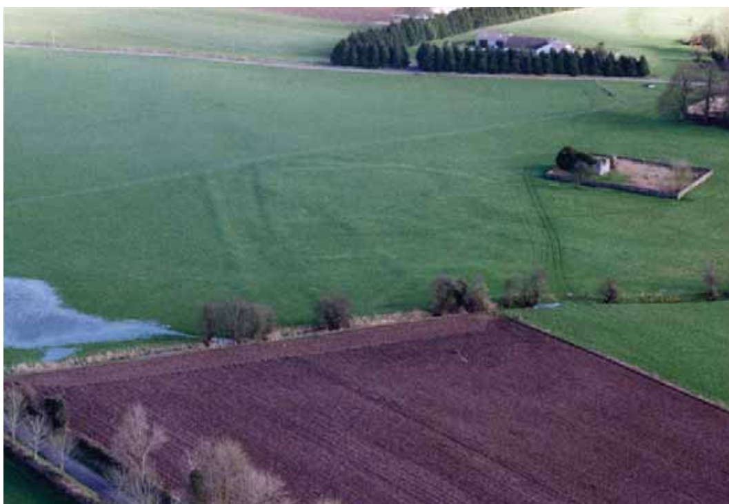
Illus. 5—Earthwork visible to the south-west of Lismore church and graveyard (RMP Nos LA022-018-01 and LA022-018-02), February 2002