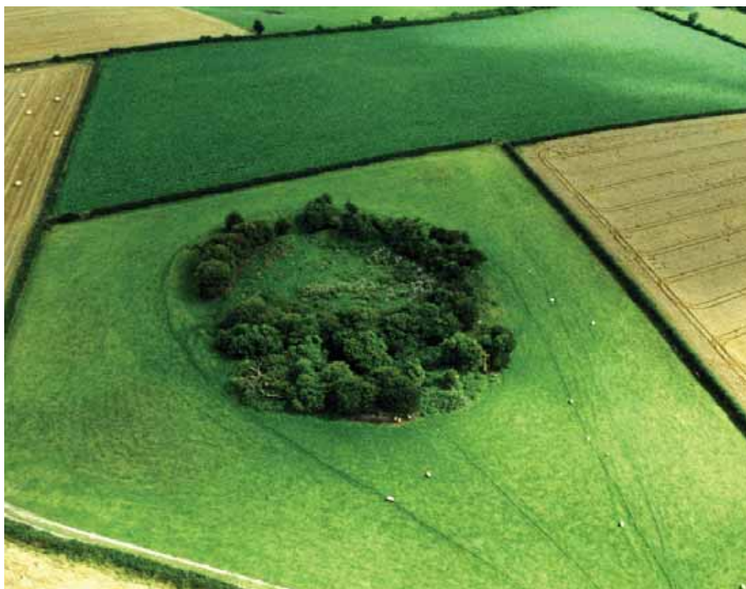
Illus. 2—Ringfort (RMP No. LA034-034) in Oldtown townland in the vicinity of the southernmost section of the M8 Portlaoise–Cullahill Motorway Scheme. Although not directly affected by the scheme, this site was photographed as part of the route selection phase