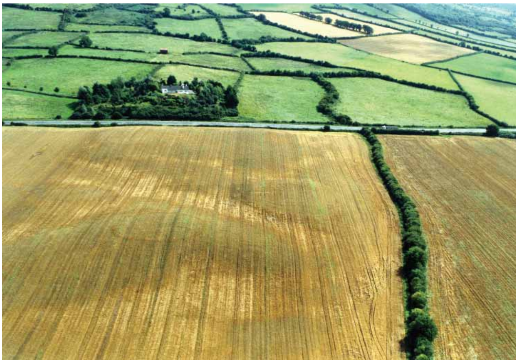
Illus. 9—Three newly identified cropmark sites in Oldtown townland from the north-west, August 2001