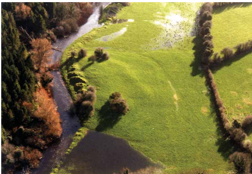
Illus. 6—Platform north-west of Boston Bridge, which may represent the remains of a burial ground, February 2001