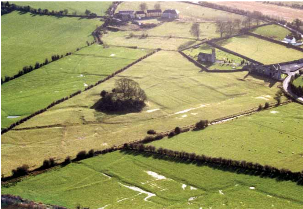
Illus. 4—Aghaboe ecclesiastical complex (RMP No. LA022-019) with possible associated earthworks, February 2002

visible and the full extent of a site can become apparent. The new information gained about the condition and preservation of individual sites can be added to the files in the Archaeological Survey of Ireland (ASI).