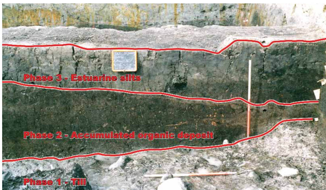
Illus. 3—Section photograph with archaeological phases indicated relating to different depositional environments

transformed, a new layer of earth was deposited or eroded away, leaving a visible and permanent record of those changes in our section drawings (Illus. 3). These layers of different coloured and textured deposits—wood peats, reed peats and estuarine silts—all indicated what the landscape had been like, while the artefacts and structures contained within them also indicated what people were doing in the landscape at particular times.