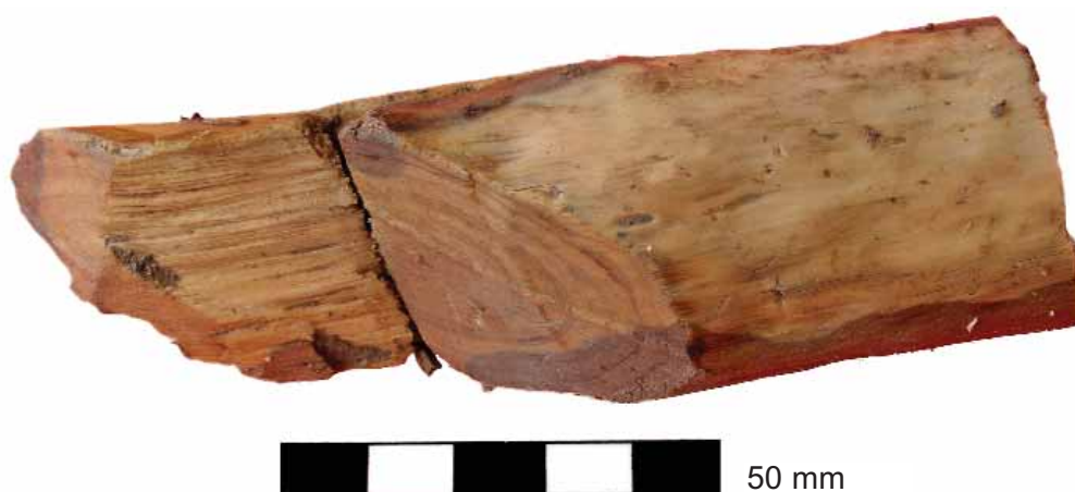
Illus. 10—Alder roundwood with toolmarks indicating that a metal axe over 50 mm in width was used. Faint lines visible on the toolmarks were caused by a nick on the axe blade, providing a tell-tale signature of the individual axe that was used (Headland Archaeology Ltd)

stakes and pegs. As we excavated to the base of the structure, we found a roundwood secured with nine pegs (Illus. 9). Why it needed so many pegs was unclear; it was approximately 0.8 m long and was not in direct physical contact with any other element. Perhaps a clue can be found in its position at the base of the tidal channel directly below the main body of the structure, a deliberate action that serves to remind us that these structures were built by people with more on their minds than just the functional need to cross a tidal stream. Arguably, this could well have been the first piece of wood to be pegged into place when the structure was first built, and could represent a symbolic or ritual practice. By securing the first element into position so emphatically, the intention could have been to imbue the entire structure with a similar stability. Perhaps also, given the importance of saltmarsh grazing, this was a public statement of ownership, granting territorial rights to the builders.