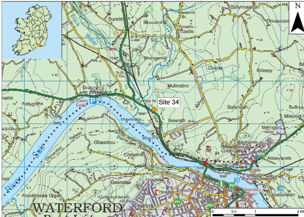
Illus. 1—Location of Site 34 at Newrath townland, Co. Kilkenny (based on the Ordnance Survey Ireland map)

Talking about his dark 1970 Korean War comedy M*A*S*H , the late Hollywood filmmaker Robert Altman said that he did not direct the film—it just escaped. Looking back on the six months my crew and I spent excavating Site 34, Newrath, Co. Kilkenny (Illus. 1), I know exactly what he meant. Affectionately known by our team as ‘The Bog’, this wetland archaeology site was excavated by Headland Archaeology Ltd on behalf of Waterford City Council, Waterford County Council, Kilkenny County Council and the National Roads Authority prior to the construction of the N25 Waterford City Bypass (NGR 259040, 114340; height 8 m OD; excavation licence no. 03E0319). As summer turned into winter it descended into a quagmire. One morning we arrived on site to find the whole area submerged beneath water over 1 m deep. Freak storms had combined with spring tides and you could canoe from one side of the valley to the other. But, miraculously, the waters receded and we lived to tell the tale.