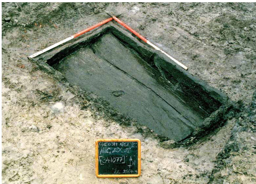
Illus. 7—Wood-lined trough associated with the burnt mound in Area 3, looking east

interpretations are plausible, it is possible that there is no one single purpose that explains them all. The depth of the trough in Area 3 was too shallow for cooking and the stake-holes made no structural pattern that would indicate a sweat-lodge, but they may have been used for pegging out textiles after processing, which might explain the shallowness of the trough.