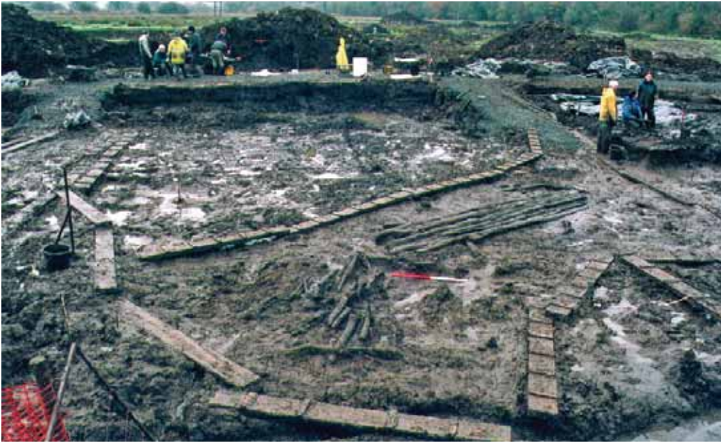
Illus. 6—Area 4, looking north, indicating the main trackway surrounded by our own plank walkway

BC (SUERC-10125) to 540–370 BC (SUERC-10127). A similar environmental change has been identified at other estuarine sites in Britain and Ireland, and is the result of much wetter conditions—both groundwater rise and rising sea levels. As tree cover diminished, the landscape became more accessible and, not surprisingly, we find trackways and platforms at Newrath to aid people’s access across the reed swamp to the water’s edge.