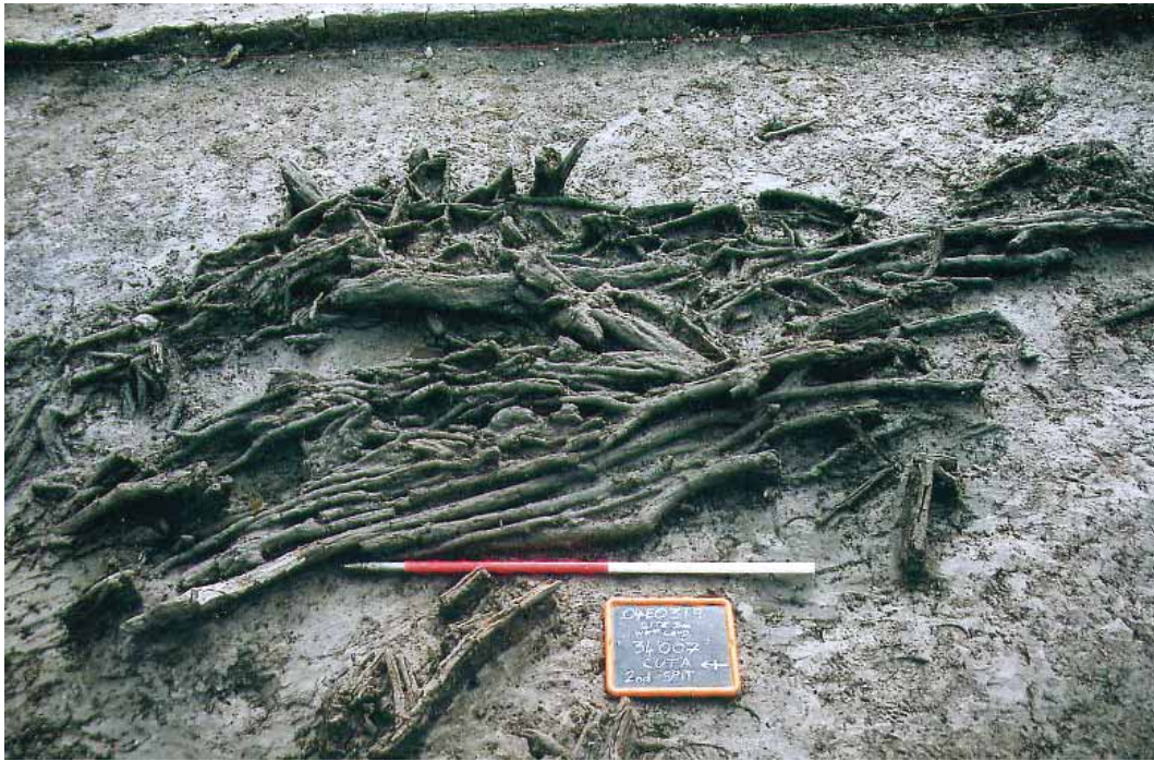
Illus. 8—Brushwood structure, Area 1, Cutting A, looking west