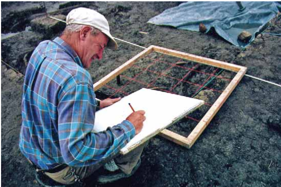
Illus. 5 (below)—Iron Age trackway in Area 1 being drawn to ensure that the exact location of all worked wood was fully recorded (Headland Archaeology Ltd)