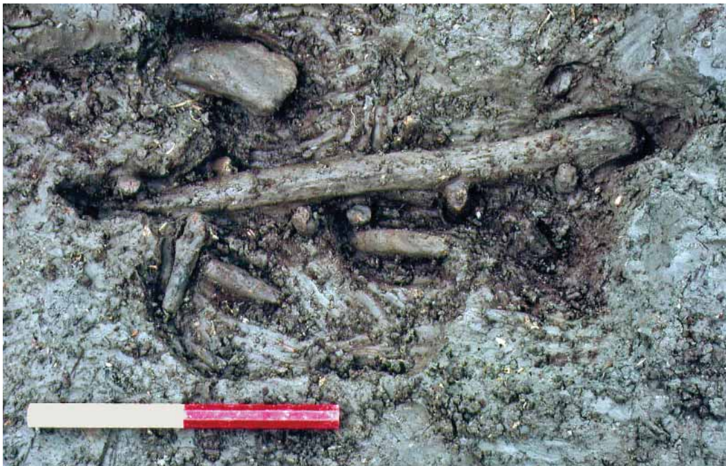
Illus. 9—Alder roundwood secured by nine pegs at the base of the tidal creek directly below an Iron Age brushwood hurdle