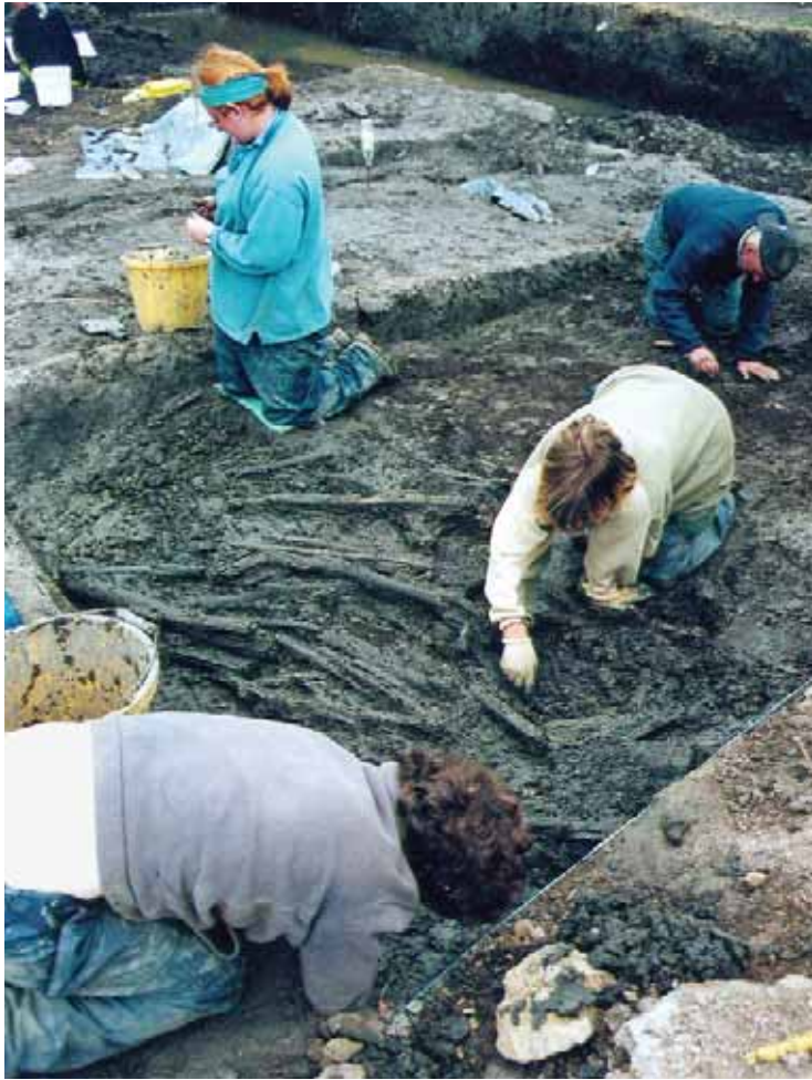
Illus. 4 (left)—Excavation team cleaning peat from an early medieval platform in Area 2 prior to recording and sampling