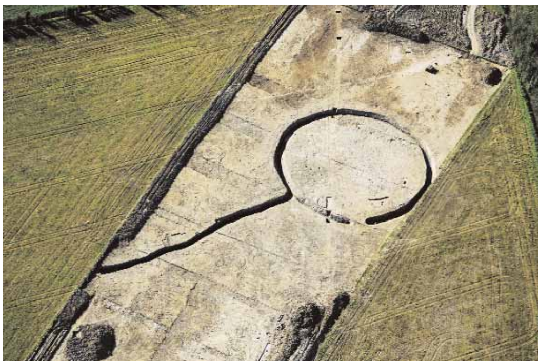
Illus. 9—Post-excavation aerial view of Ross 1, a large rath that may have been used to enclose livestock in times of danger.

The findings from the M3 incorporate a diversity of archaeological evidence that demonstrates the presence of lordly and peasant dwellings, military fortifications, specialist agricultural centres and livestock enclosures. (In addition to the enclosed sites, a possible open settlement is also represented by an unenclosed souterrain at Lismullin 1, excavated by Aidan O’Connell.) 7 This complex picture of early medieval life and society differs very much from the oversimplified and static view of early medieval Ireland that only recognised a landscape of raths, crannogs and ecclesiastical sites, which represented the dwelling-places of the free and prosperous (see Monk 1998; O’Sullivan 1998).