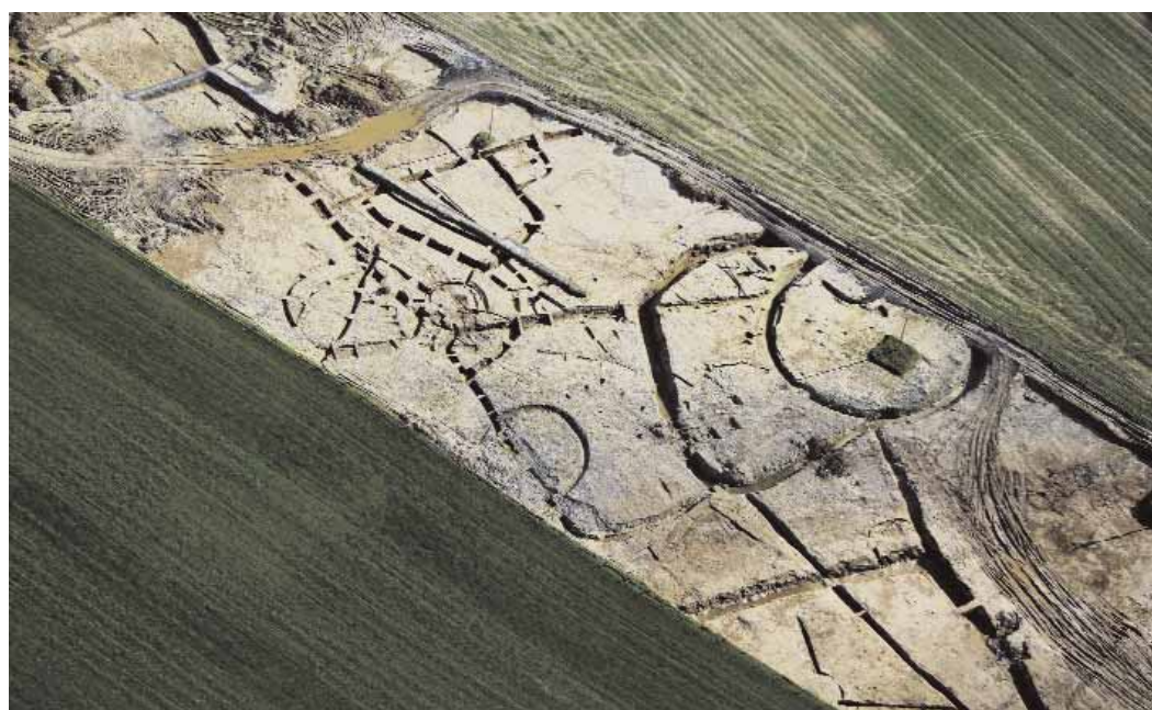
Illus. 7—Post-excavation aerial view of the multiphase enclosure at Dowdstown 2 (Studio Lab).

the enclosing ditches across many centuries, almost certainly required the labour of 'base clients' and the servile classes, and, essentially, both settlements were located on agriculturally productive soils. Roestown and Castlefarm, therefore, were probable high-status or perhaps even lordly dwellings, occupied by people of some power and wealth.