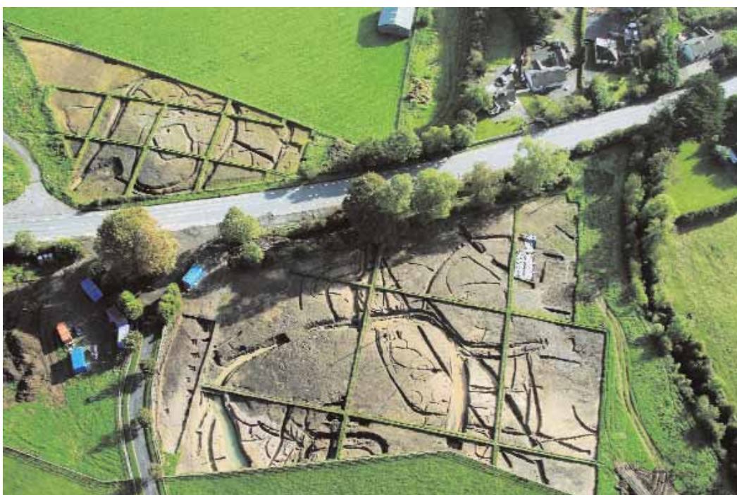
Illus. 5—Post-excavation aerial view of the settlement at Roestown 2 (Studio Lab).