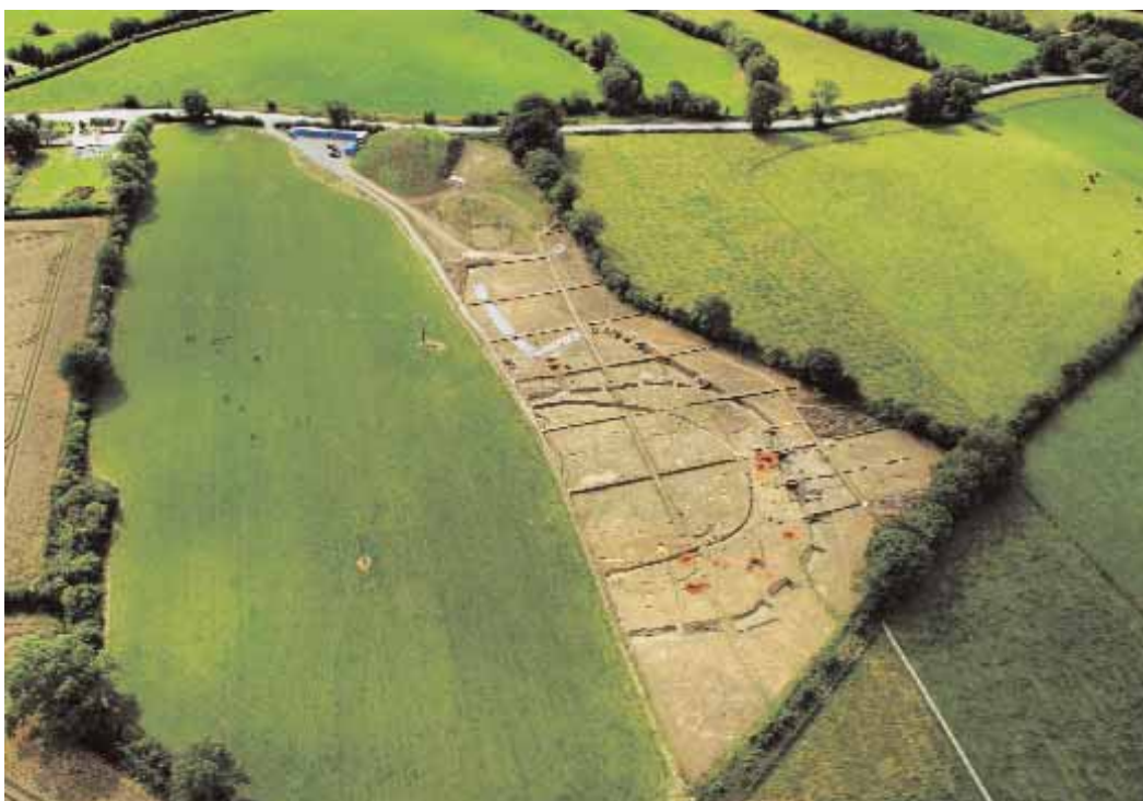
Illus. 4—Aerial view of the multiphase enclosed settlement at Castlefarm 1 (Studio Lab).