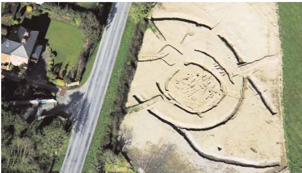
Illus. 3—Post-excavation aerial view of Collierstown 1 cemetery.