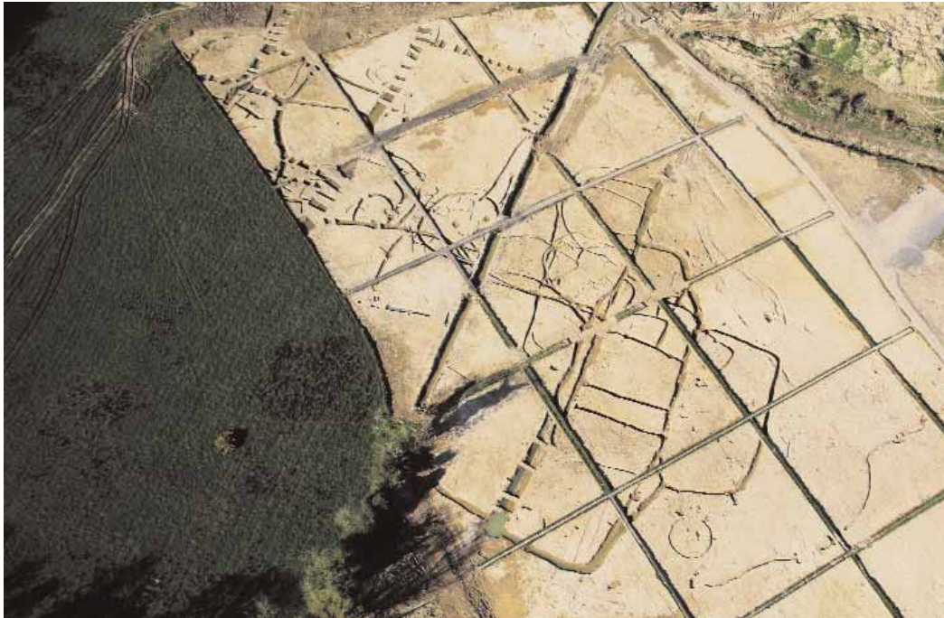
Illus. 10—Post-excavation aerial view of Boyerstown 3, a multiphase enclosure complex (Studio Lab).