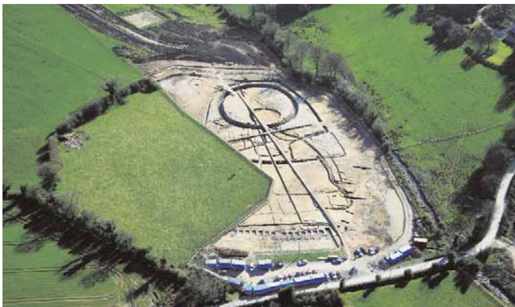
Illus. 8—Post-excitation aerial view of the fort at Baronstown 1, which may have had a defensive or military function (Studio Lab).

Other sites uncovered along the scheme demonstrate a variety of functions, including an enclosure possibly used to manage livestock at Ross 1, excavated by Ken Wiggins (Illus. 9). 5 This interpretation is based on a complete lack of occupation evidence within the enclosure and a very limited quantity of artefacts and animal bone. It may transpire, when post-excitation is complete, that the enclosure was occupied, but this cannot be determined at present. It is known, however, that some Irish raths produce little or no structural or artefactual evidence, leading to the suggestion that these are basically cattle corrals. The partial remains of two raths were excavated by Audrey Gahan and Stuart Reilly at Calliaghstown 1. 6 Both, as at Ross, produced little in the way of finds. They were situated on agriculturally poor land, surrounded by wetland, and may be interpreted as the dwelling-places of low-status farmers who were separated, in economic and societal terms, from the wealth and prominence enjoyed by the lords at Roestown and Castlefarm.