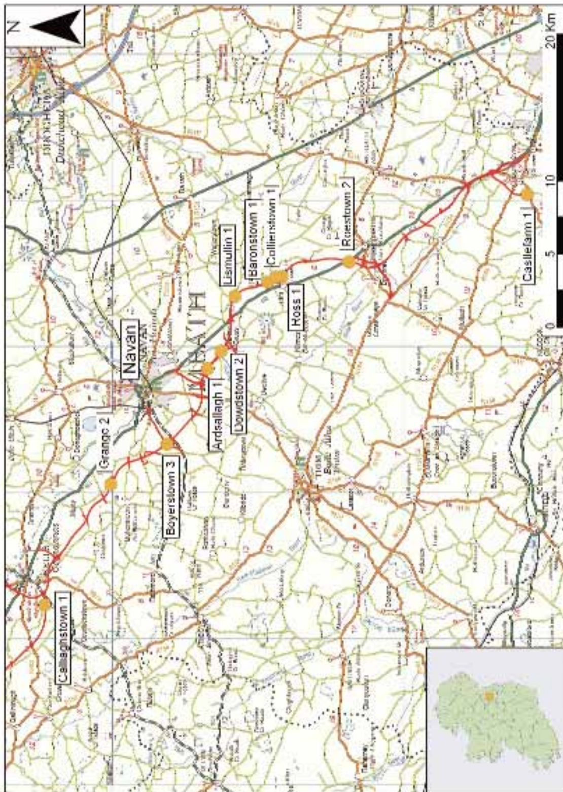
Illus. 1—Location of the principal early medieval sites on the M3 Clonee–North of Kells motorway scheme, Co. Meath (based on the Ordnance Survey Ireland map).