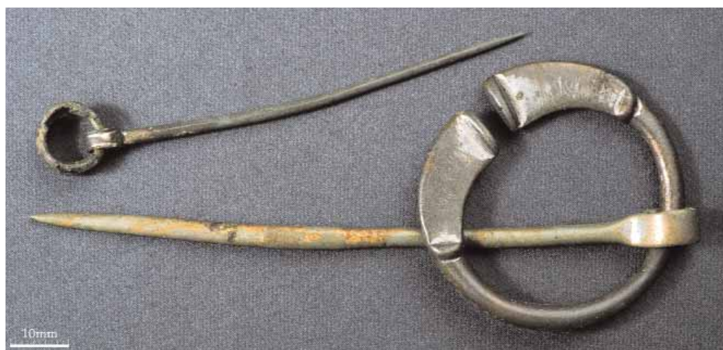
Illus. 6—A penannular brooch and a spiral-ringed, loop-headed pin from Castlefarm 1 (John Sunderland).