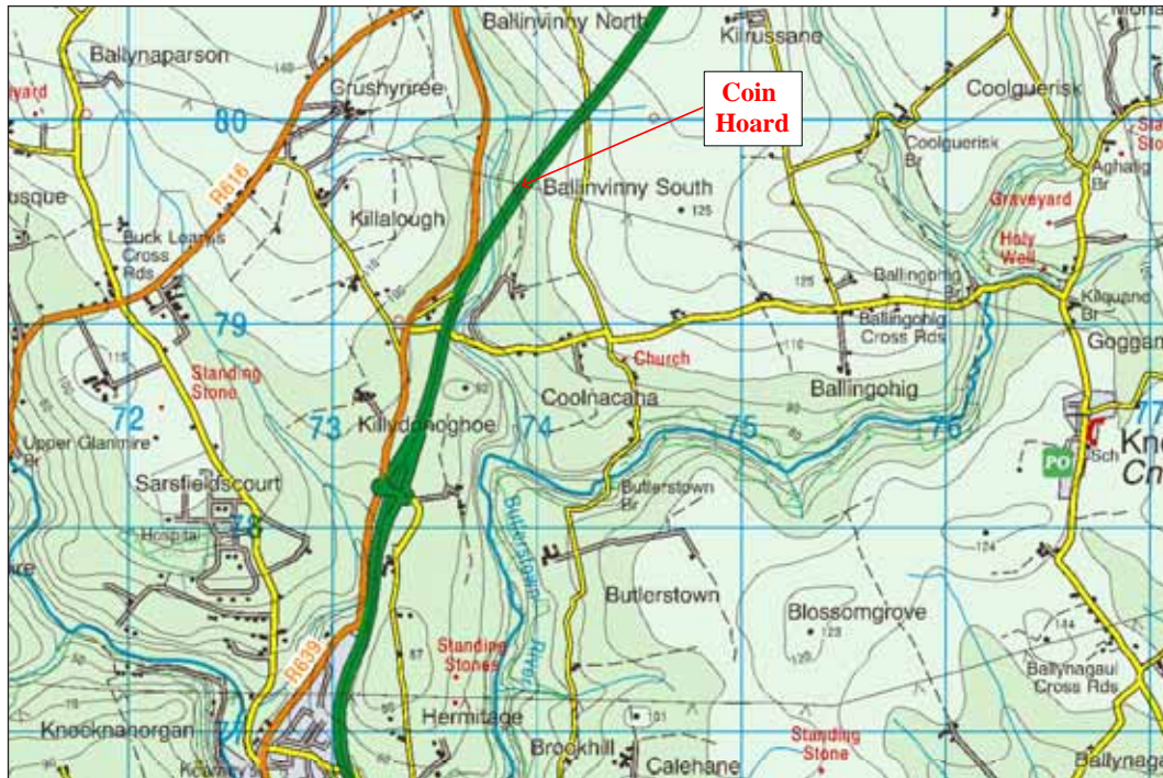
Illus. 1—Site location map of Ballinvinny South coin hoard following construction of the N8 Glanmire–Watergrasshill Road Scheme (based on the Ordnance Survey Ireland map)

The following paper aims to highlight both the excitement and potential of archaeological discovery and the importance of rigorous archaeological investigation as part of the road design and delivery process.