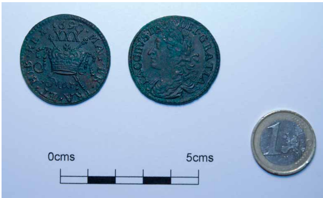
Illus. 4—Gun money half crowns from Ballinvinny South (Cork County Council)

Ireland King 1689). The month was also included, probably to allow for the coins to be redeemed in the order in which they were issued (Colgan 2003, 142).