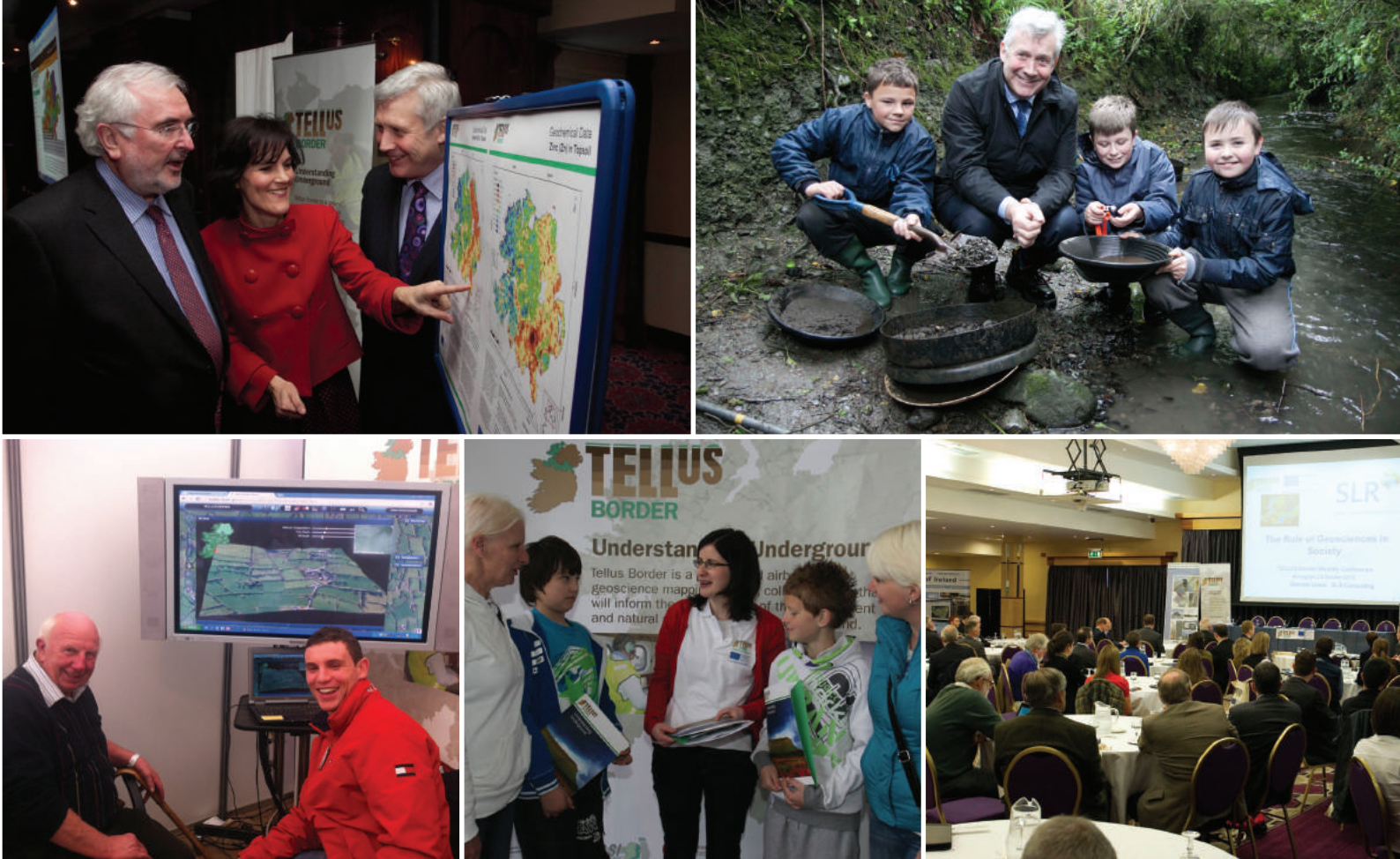
Figure 4.3. Tellus Border stakeholder engagement events.

Results and Research Conference, 52 delegates identified themselves across 14 different sectors (Fig. 4.4), and provided feedback on quality of events and of project outputs.