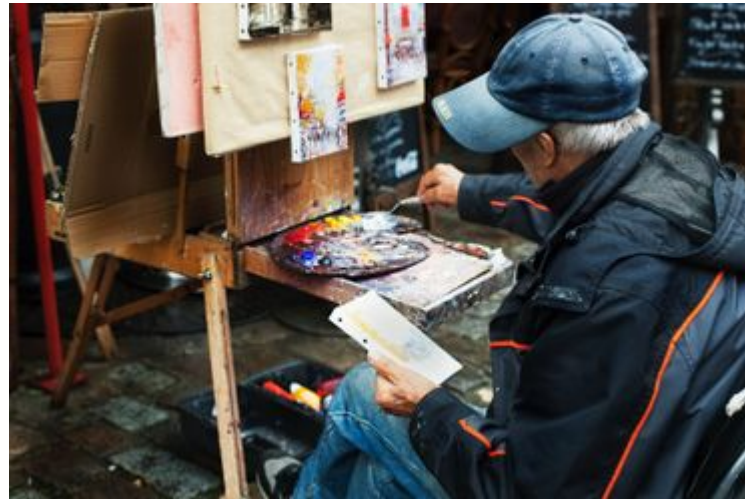
Figure 1: Artist at work