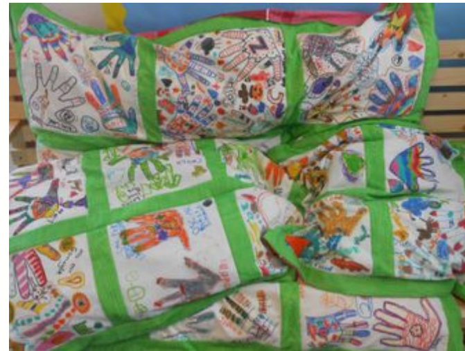
Figure 17: Patchwork cushions