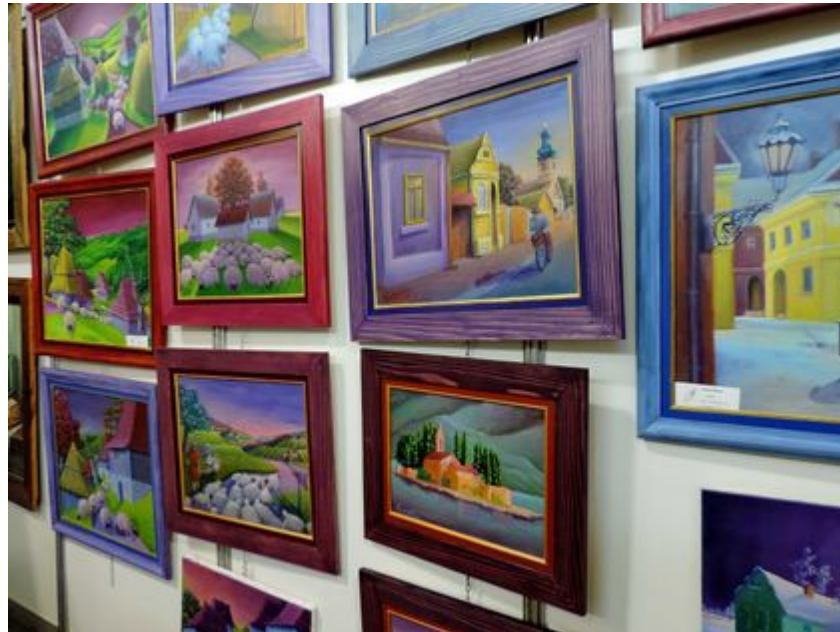
Figure 8 : Art exhibition