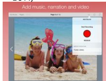
Figure 14: Book Creator (Ford, 2014)