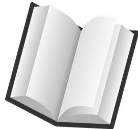
Figure 3: Introduction