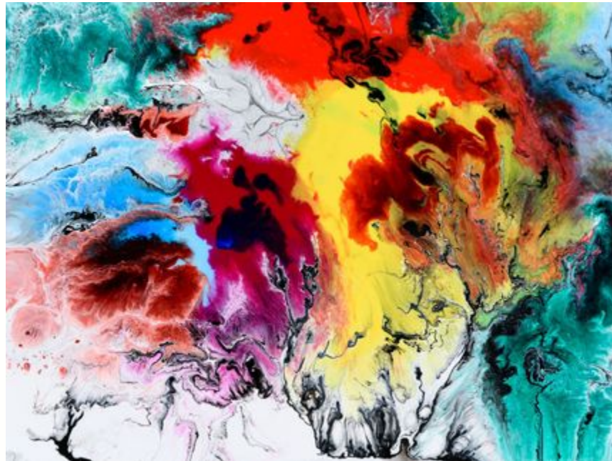
Figure 9 : Painting