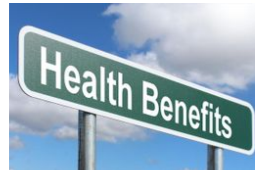
Figure 4: Health Benefits