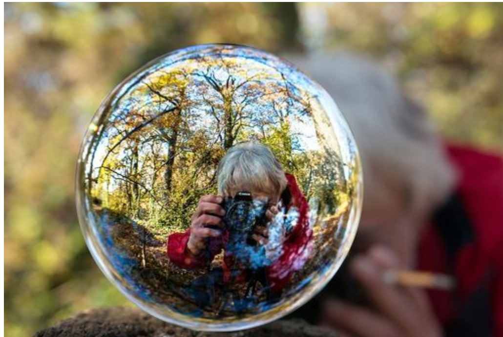
Figure 15: Photographer at work