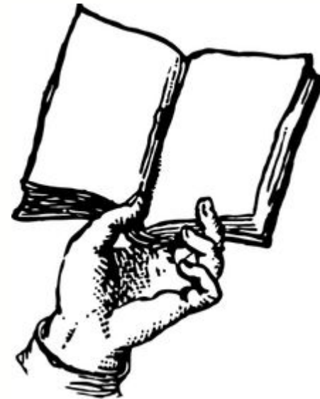
Figure 2: Table of contents