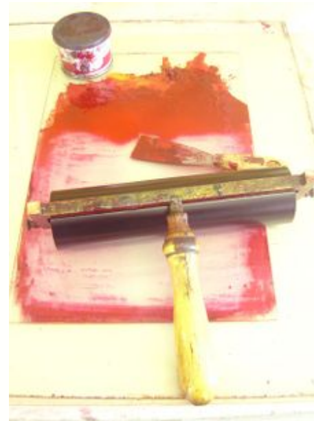
Figure 18: Printing in action