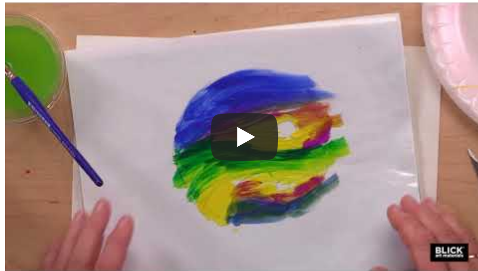
Figure 10 : Stained glass effect (Blick, 2017)