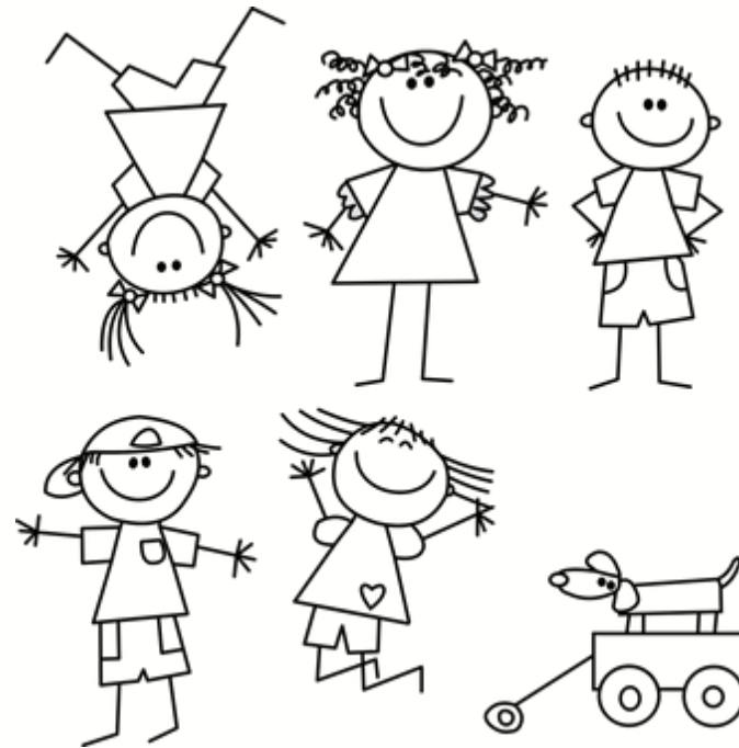
Figure 6: Innovation in art