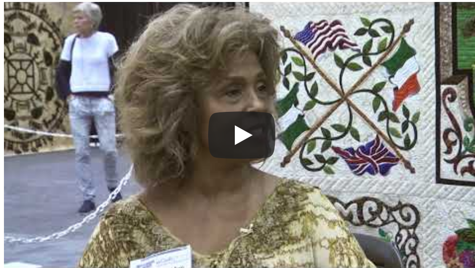
Figure 16: Quilt Artist (Browning, 2017)