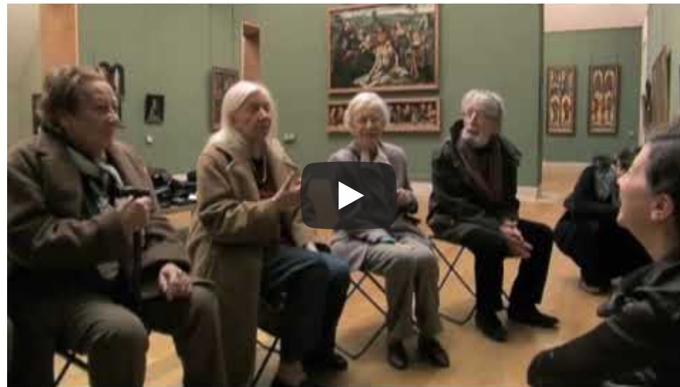
Figure 7: I remember better when I paint. (Ellena & Heubner, 2010)