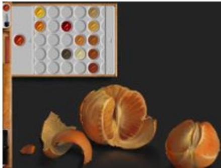
Figure 11: Art set (Ford, 2014)

Ipads are a cost effective and innovative way to introduce technology to dementia patients (Ford, 2014).