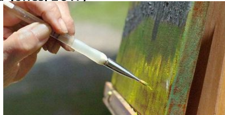
Figure 5: Art for all