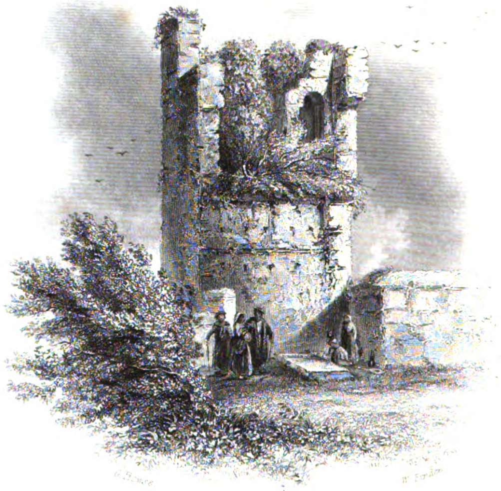
The Old Tower, 1840