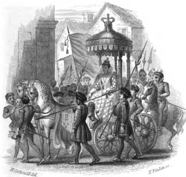
Elizabeth in procession to St. Pauls to return thanks for the failure of the Spanish Armada.