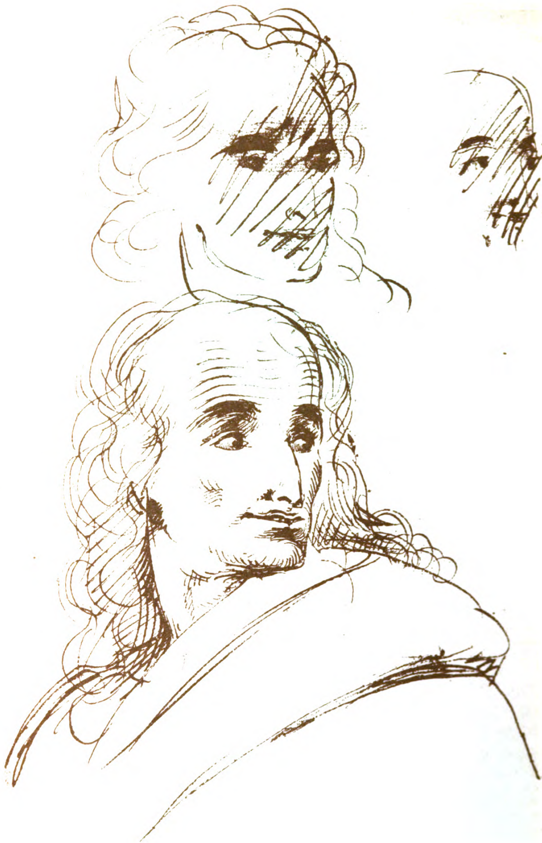
A Study from memory of an expression in insanity.