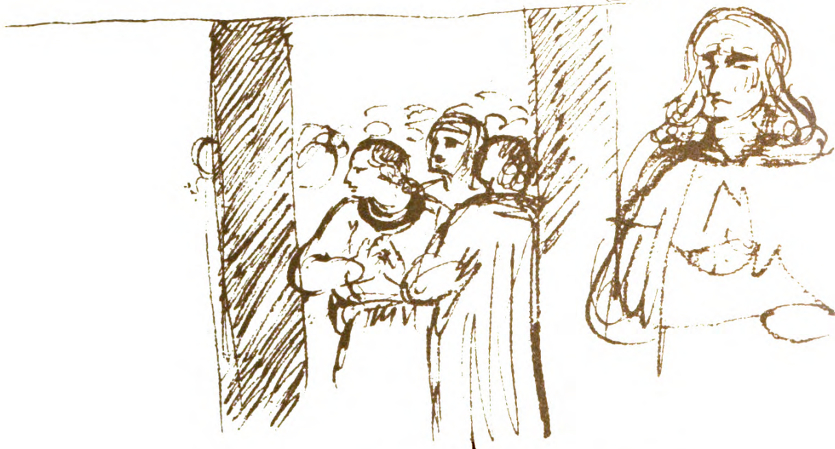
"A vile caricature of B. R. Haydon by John Keats."