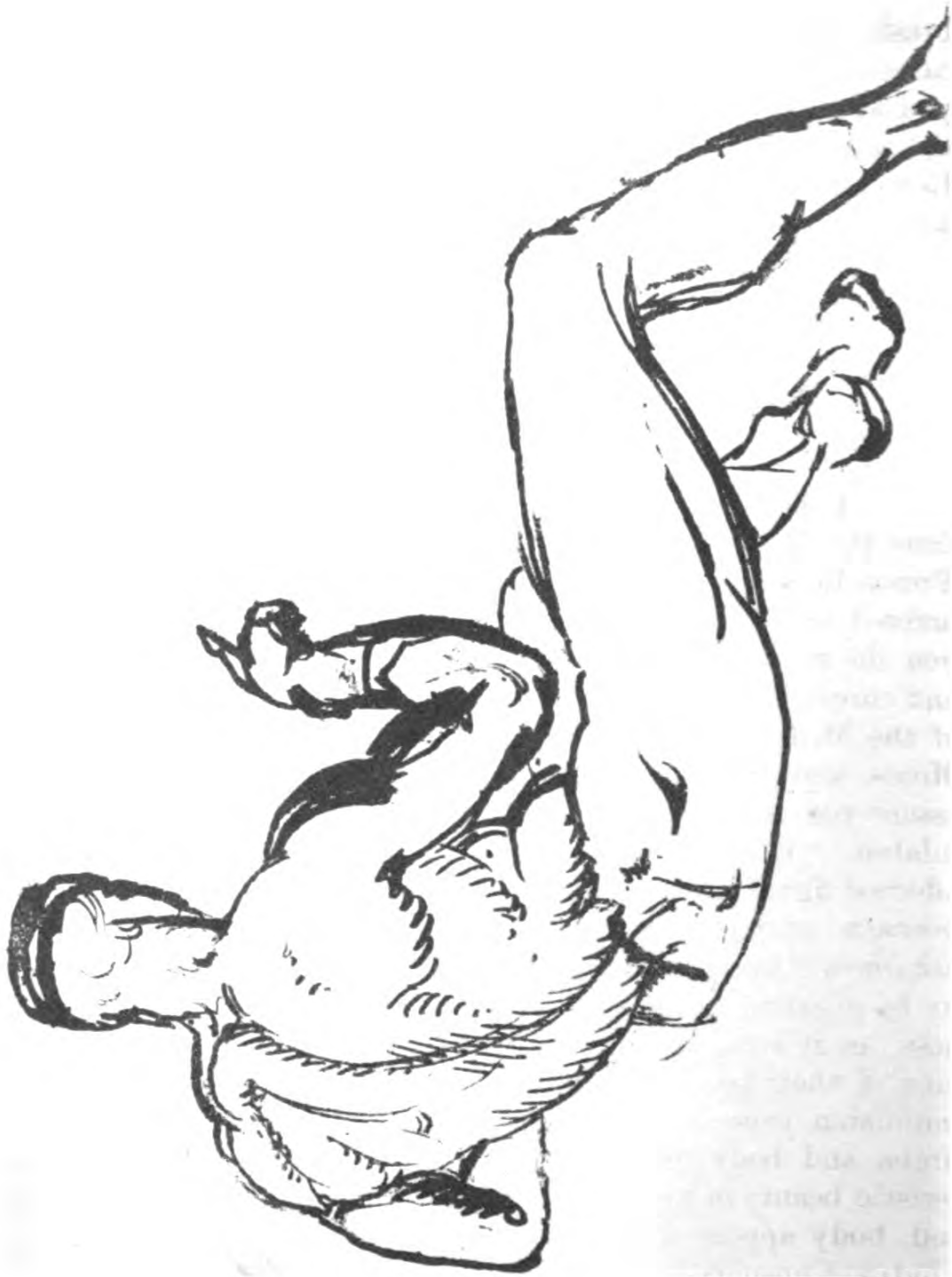
Early Sketch by Hayden of the Thosets.