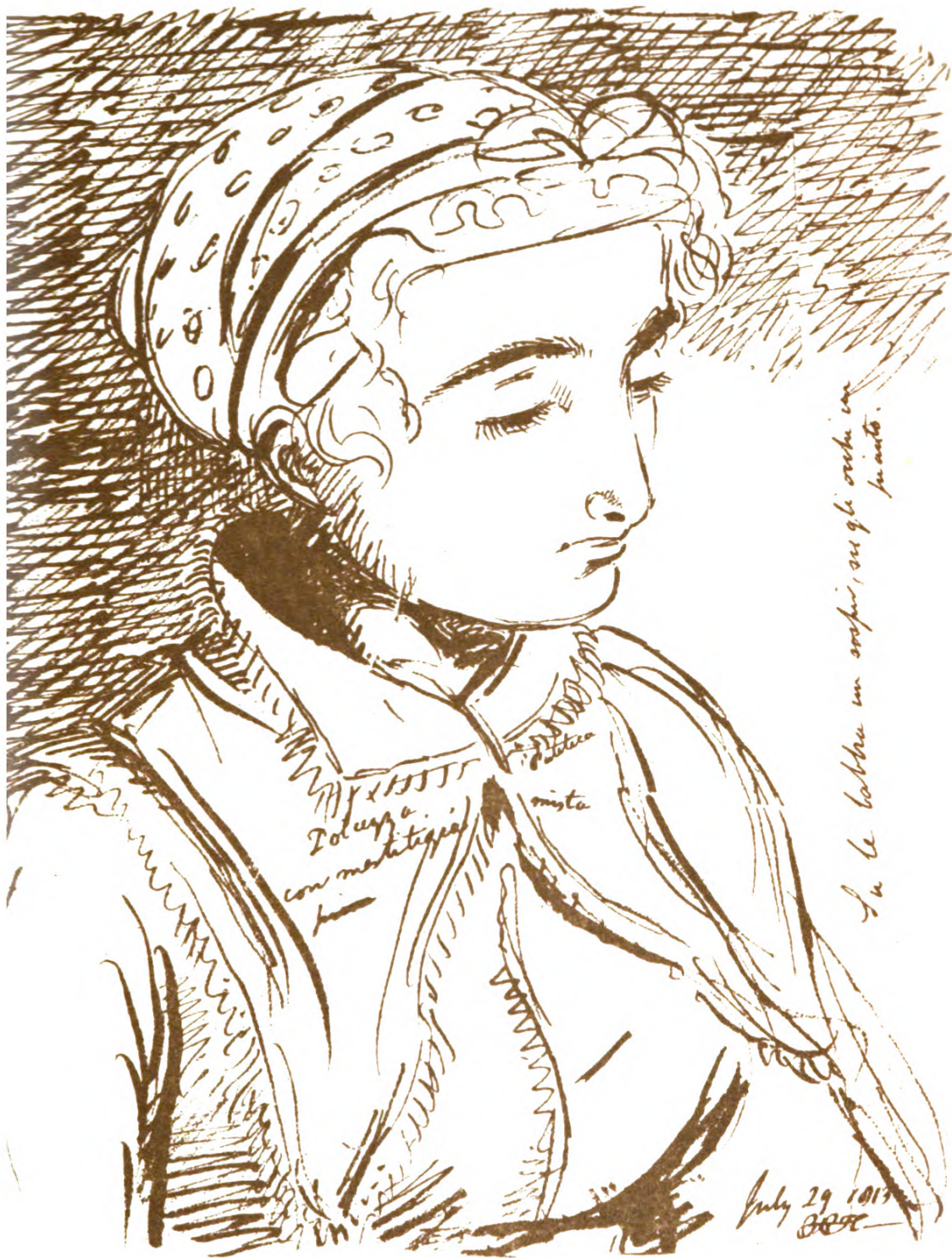
A Study. - 1813.