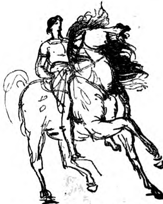
Sketch for Alexander and Bucephalus.—1826.