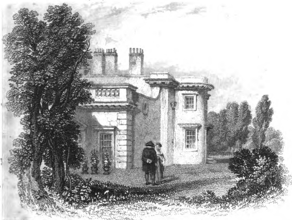
Drawn by - Starfield R.A.