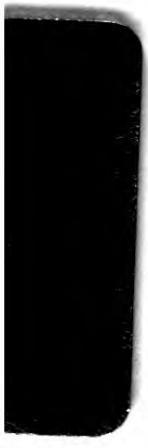
Fig. 27426 e. 35