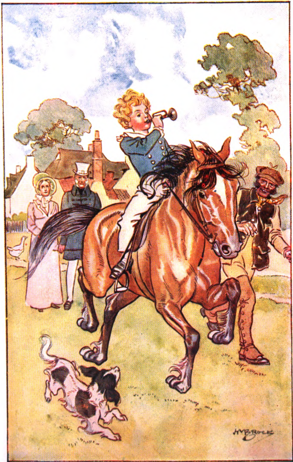
“ Away went Lollo ” (p. 37).