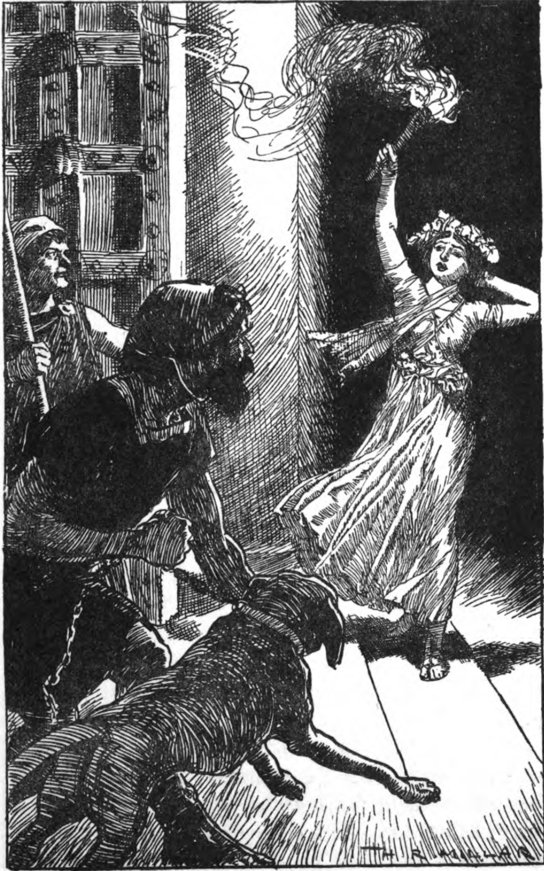
They threatened to put the dogs upon her 57