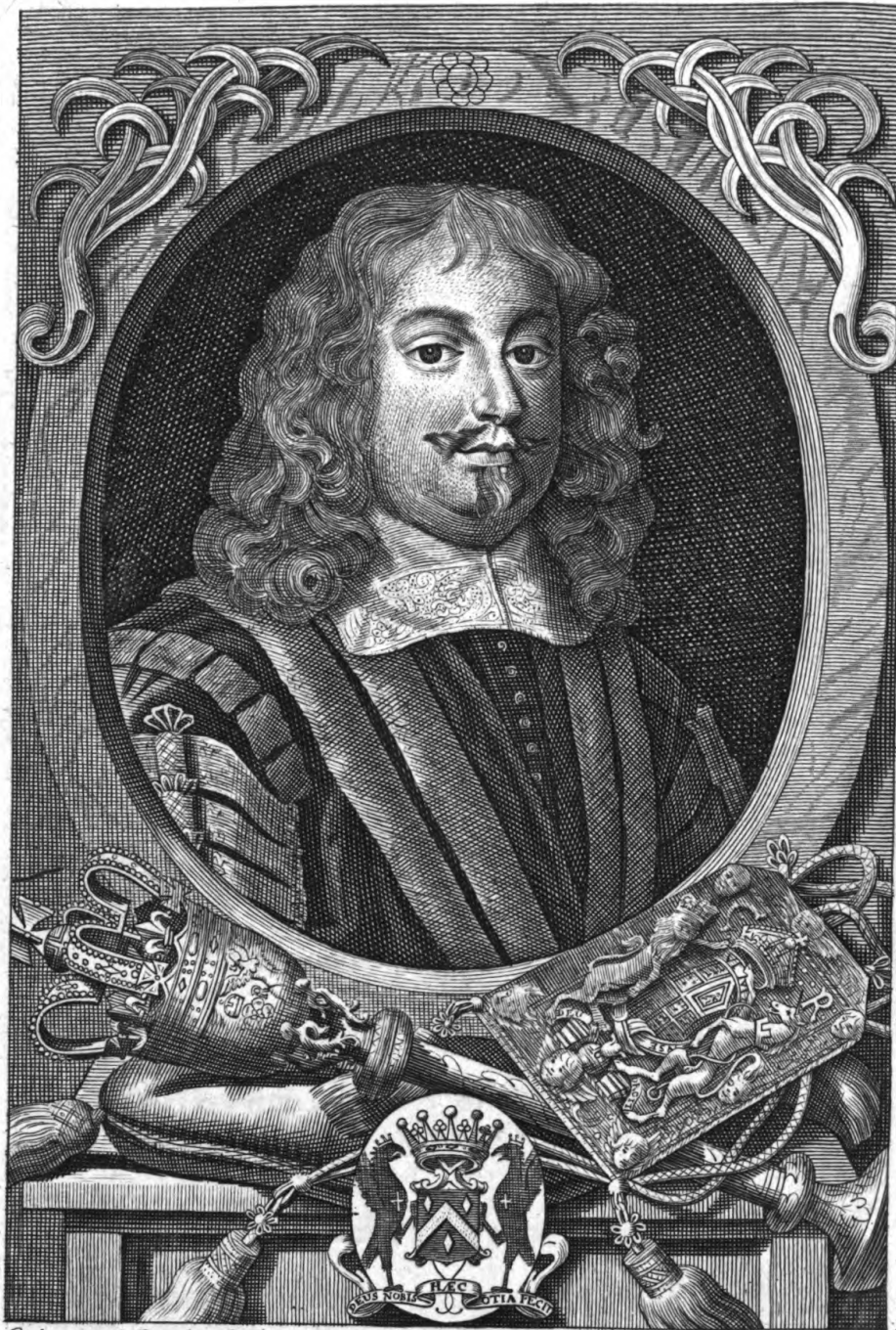
Edward Earl of CLARENDON, Lord High CHANCELLOR of England and Chancellor of the University of Oxford An. Dni. 1667.