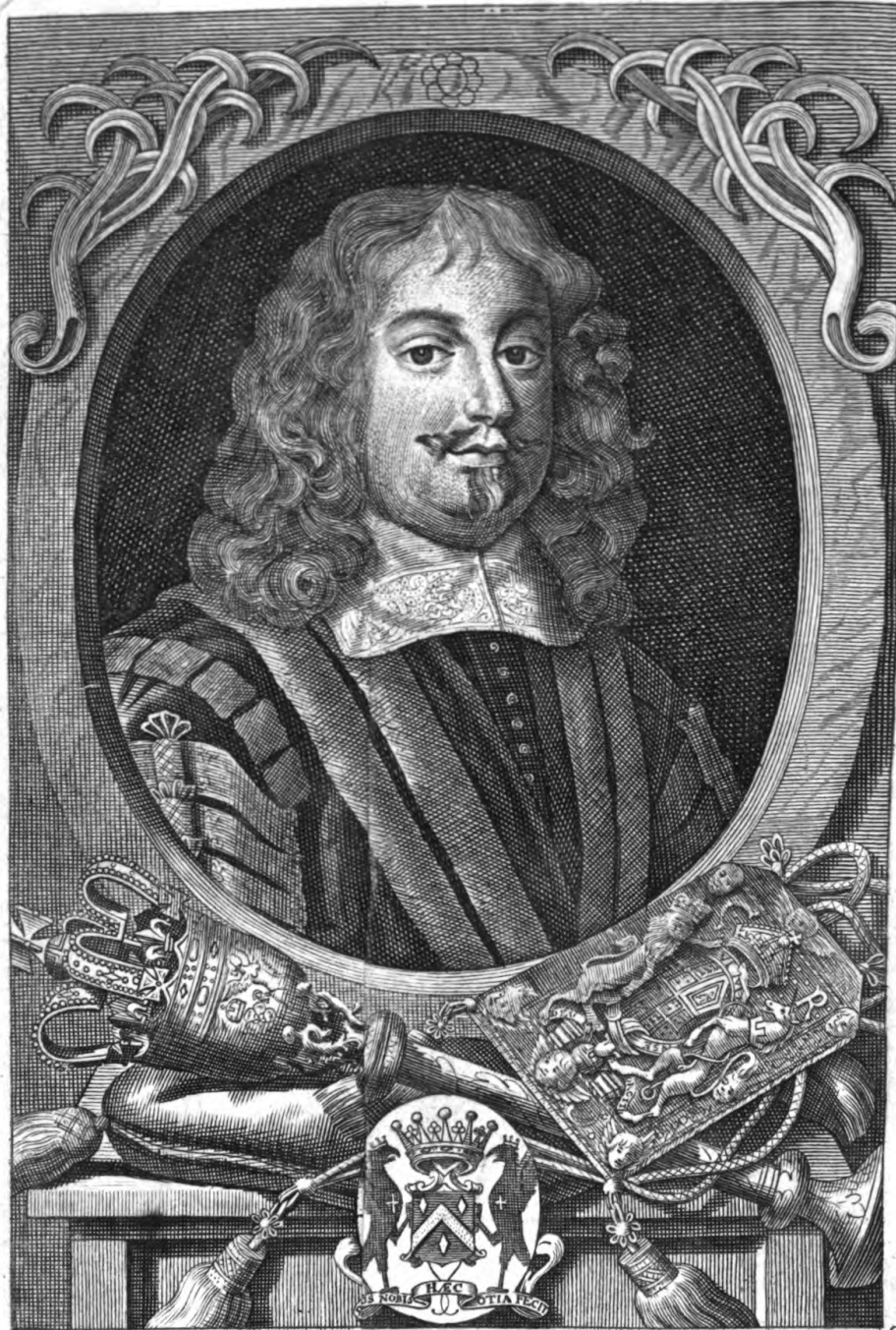
Edward Earl of CLARENDON, Lord High CHANCELLOR of England and Chancellor of the University of Oxford An. Dni. 1667.