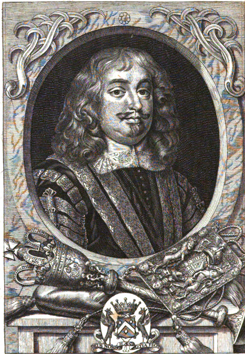
Edward Earl of CLARENDON Lord High CHANCELLOR of England, and Chancellor of the University of Oxford An. D. m. 1667.