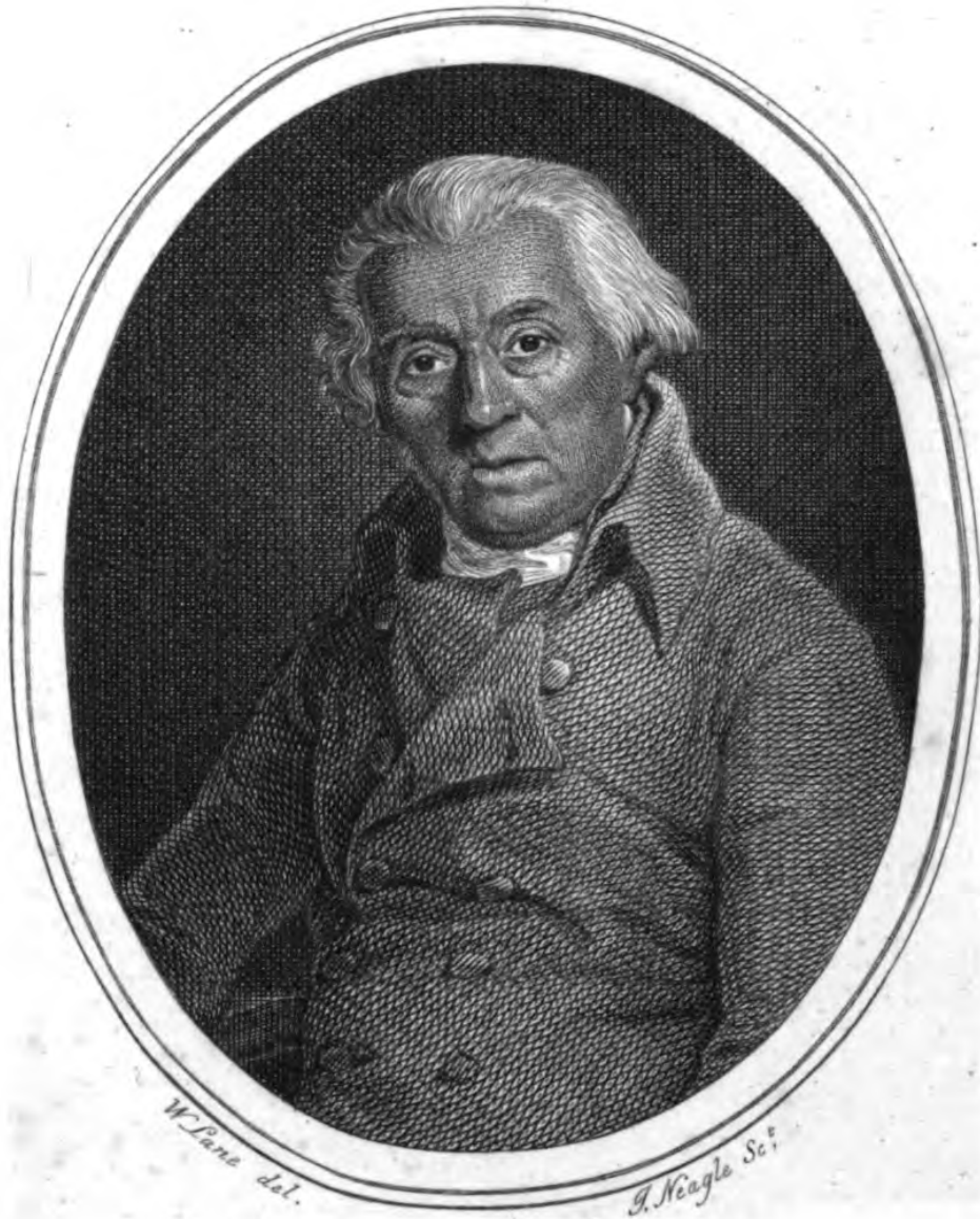
RICHARD CUMBERLAND ESQ.

London Published Sep: 1. 1802 by Longman & Rees Paternoster Row.