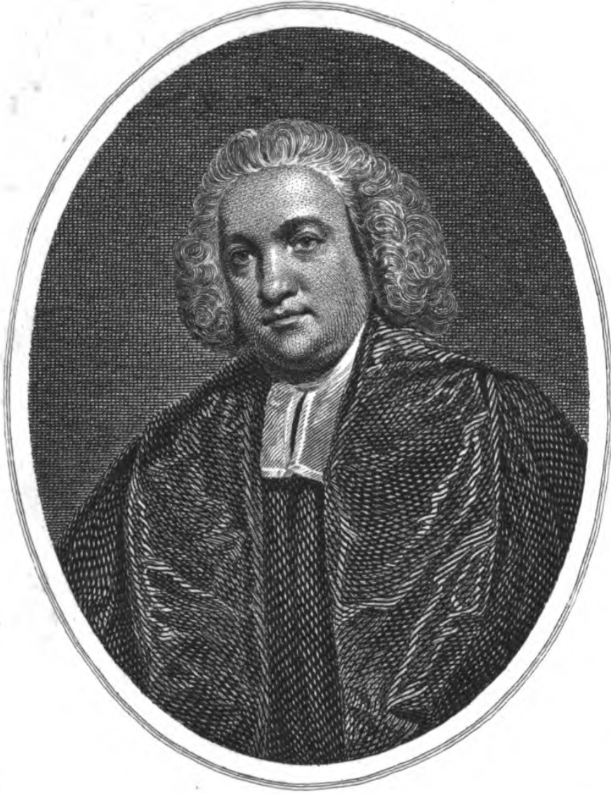
JOSEPH WARTON L.L.D.

London Published Sep: 1. 1802 by Longman & Rees. Paternoster Row.