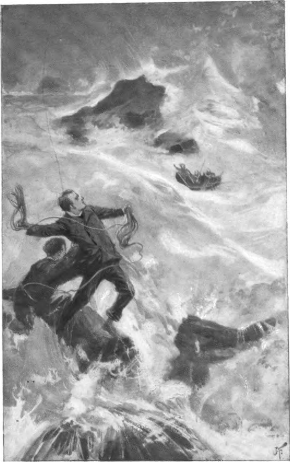
FOR AN INSTANT IT SEEMED AS IF NOTHING COULD SAVE HIM