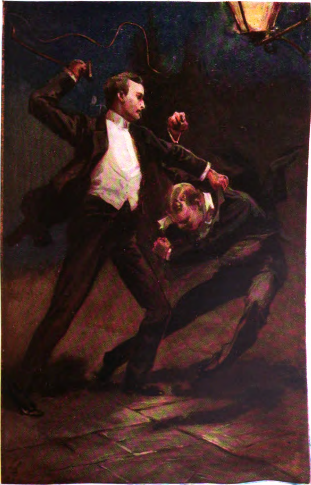
HE CONTINUED HIS HORSEWHIPPING TO THE BITTER END