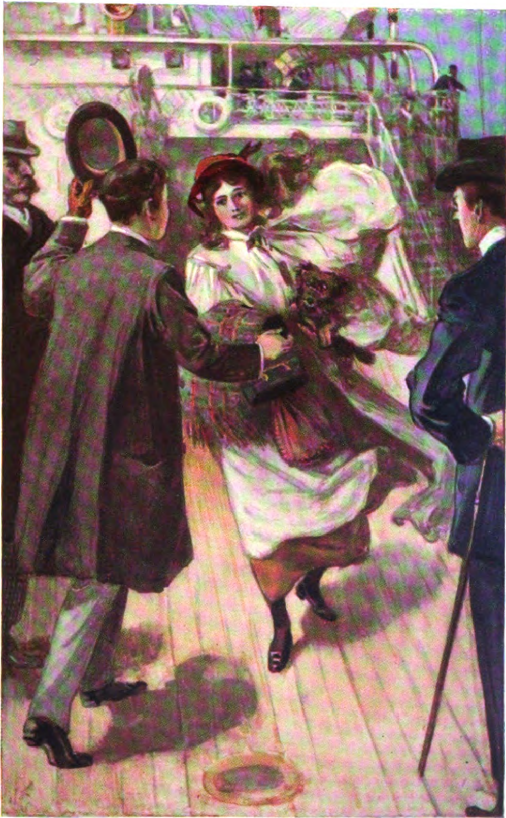
"LET ME HELP YOU, COUSIN ROSALIND," SAID ROGER