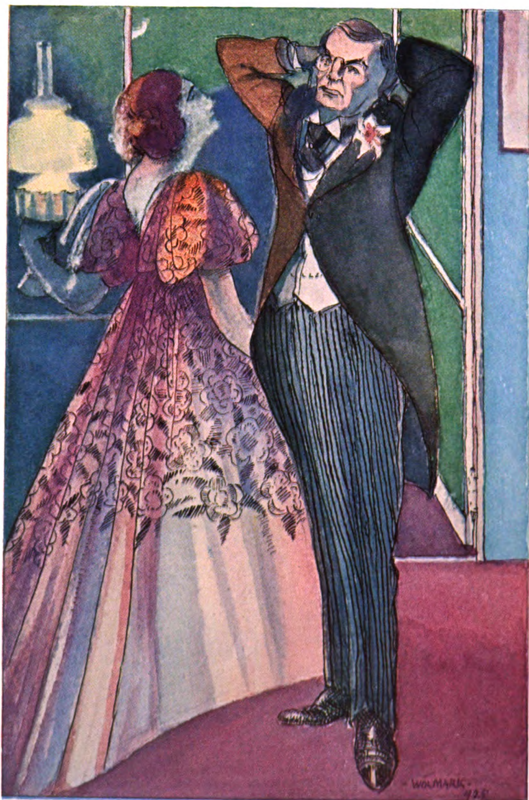
Broser--" Not without a kiss?" All gra. She snatched up the lamp, half in defiance