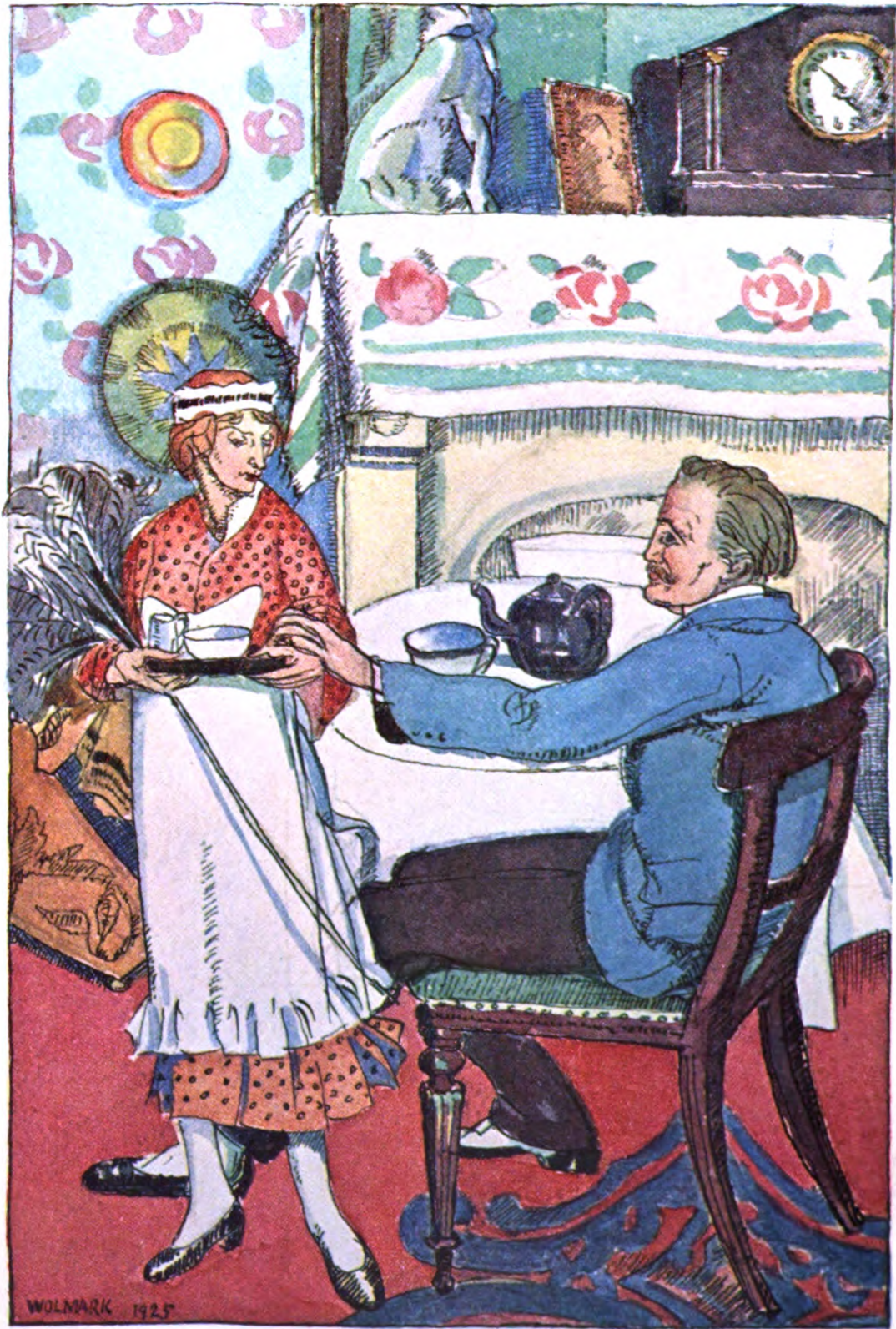
Merely Mary Ann