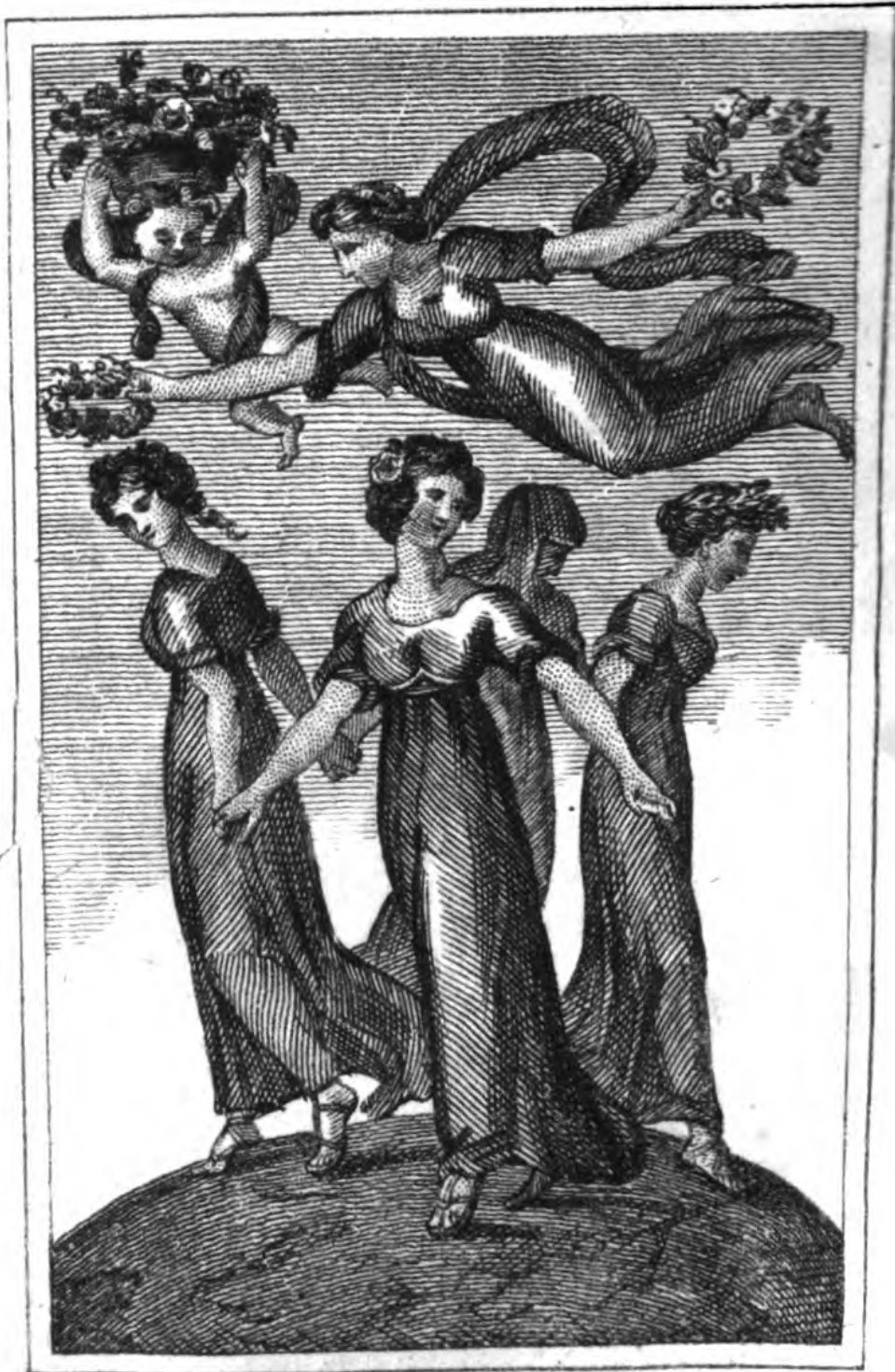
Flora decorating the Seasons