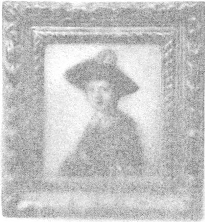
211 A woman in the p...