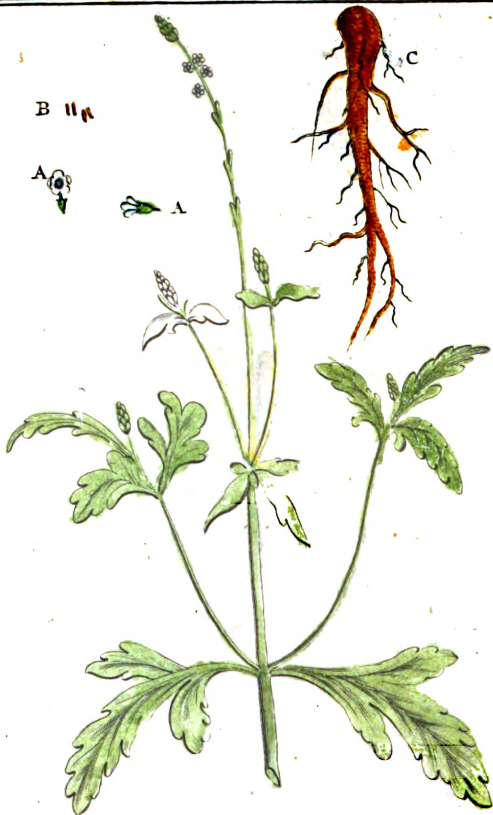
The Common Purple Vervain