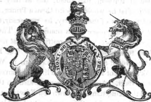
DUKE OF YORK.

PRINCE FREDERIC, second son of his present Majesty, was born August 16th, 1763. He was elected bishop of Osnaburg, Feb. 27th, 1764. At a chapter of the Bath, held December 30th, 1767, he was invested with the ensigns of that most honourable order, and installed in Henry VII's chapel, as first and principal companion, June 15th, 1772. He was elected a companion of the most noble order of the Garter, June 19th, 1771, and installed at Windsor, the 25th of the next month. On the November 27th, 1784, he was created Duke of York and Albany, in Great Britain, and Earl of Ulster, in Ireland. His Royal Highness is LL. D. F. R. S. a field-marshal, commander in chief of all the King's land forces in the United Kingdom; colonel of the first regiment of foot-guards; colonel in chief of the sixtieth, or royal American regiment of foot, and of the royal Dublin regiment of infantry; ranger of St. James's and Hyde Parks, and warden and keeper of the New Forest, Hampshire.