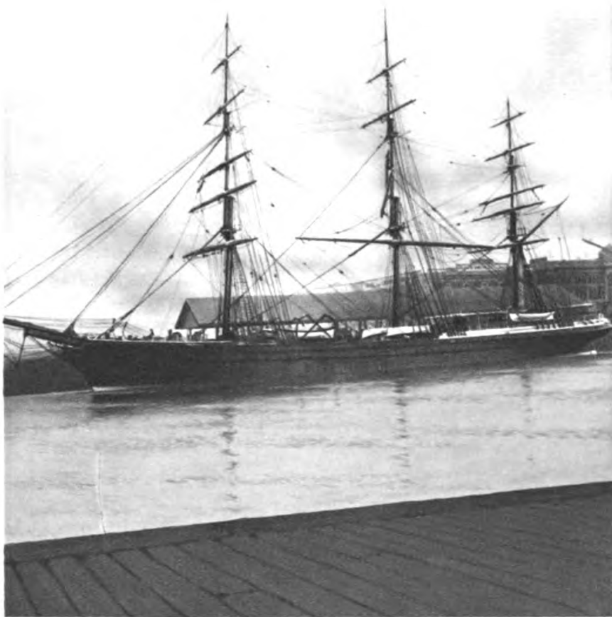
THE "TORRENS". It was during a cruise on this ship that Joseph Conrad shewed the MS of Almayer's Folly to John Galsworthy.