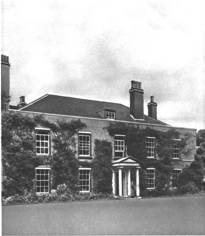
OSWALDS, BISHOPSBOURNE, KENT. Here "The Rescue" begun twenty years earlier, was completed.