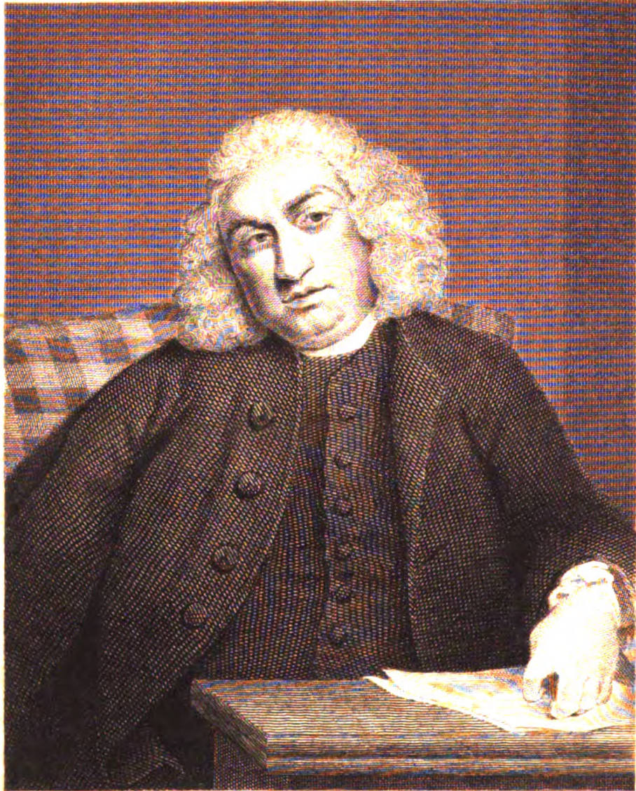
Sir J Reynolds R. S. A.