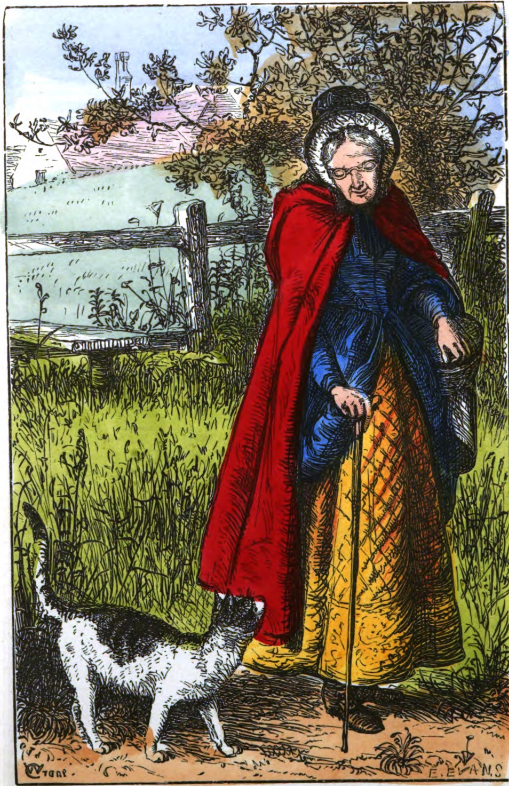
So he gave a "mew, mew!" as if to say, "All right, Goody!"—P. 36.