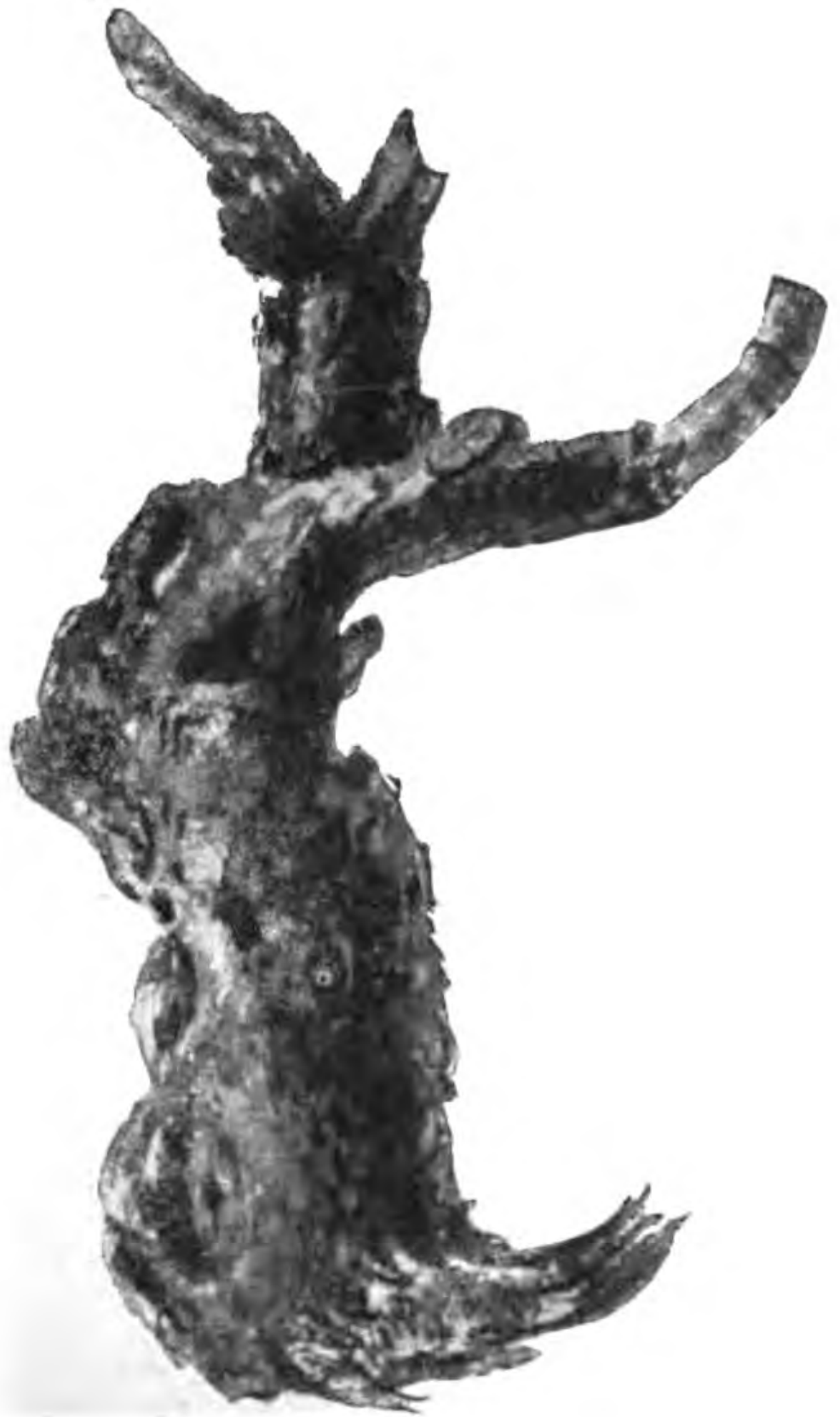
BRANCHES. CLEANSSED, AND ABIDING.