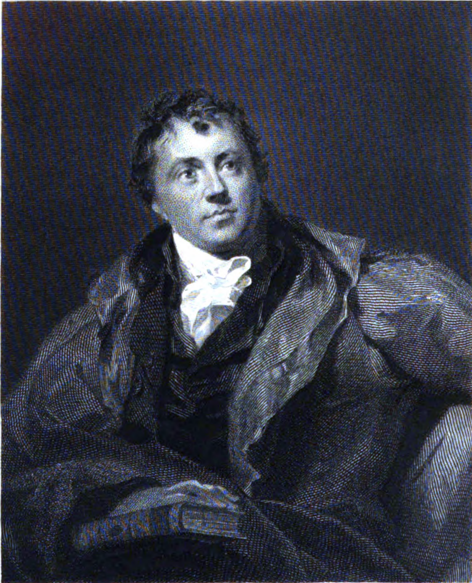
Painted by Sir T. Lawrence.