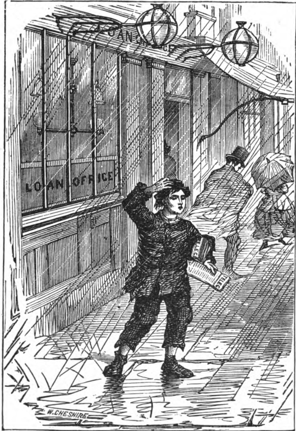
TIM THE NEWSBOY.