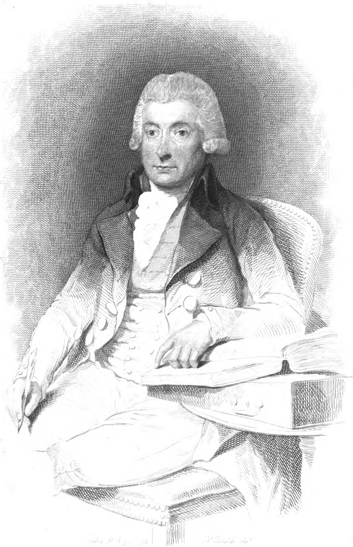
WILLIAM COWPER ESQ.