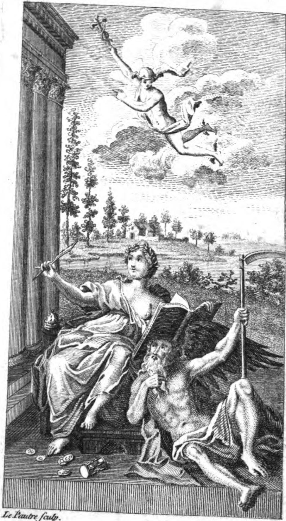
Le Peuple saup.